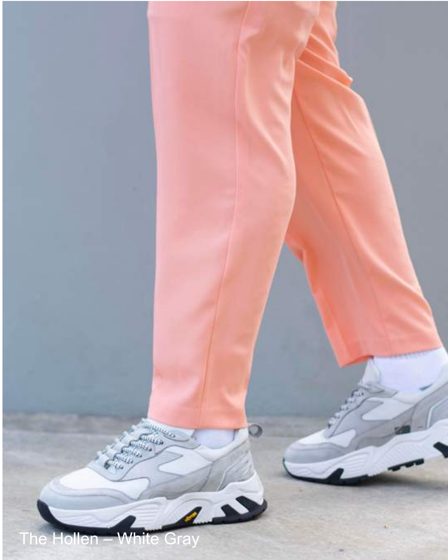
The Hollen – White Gray