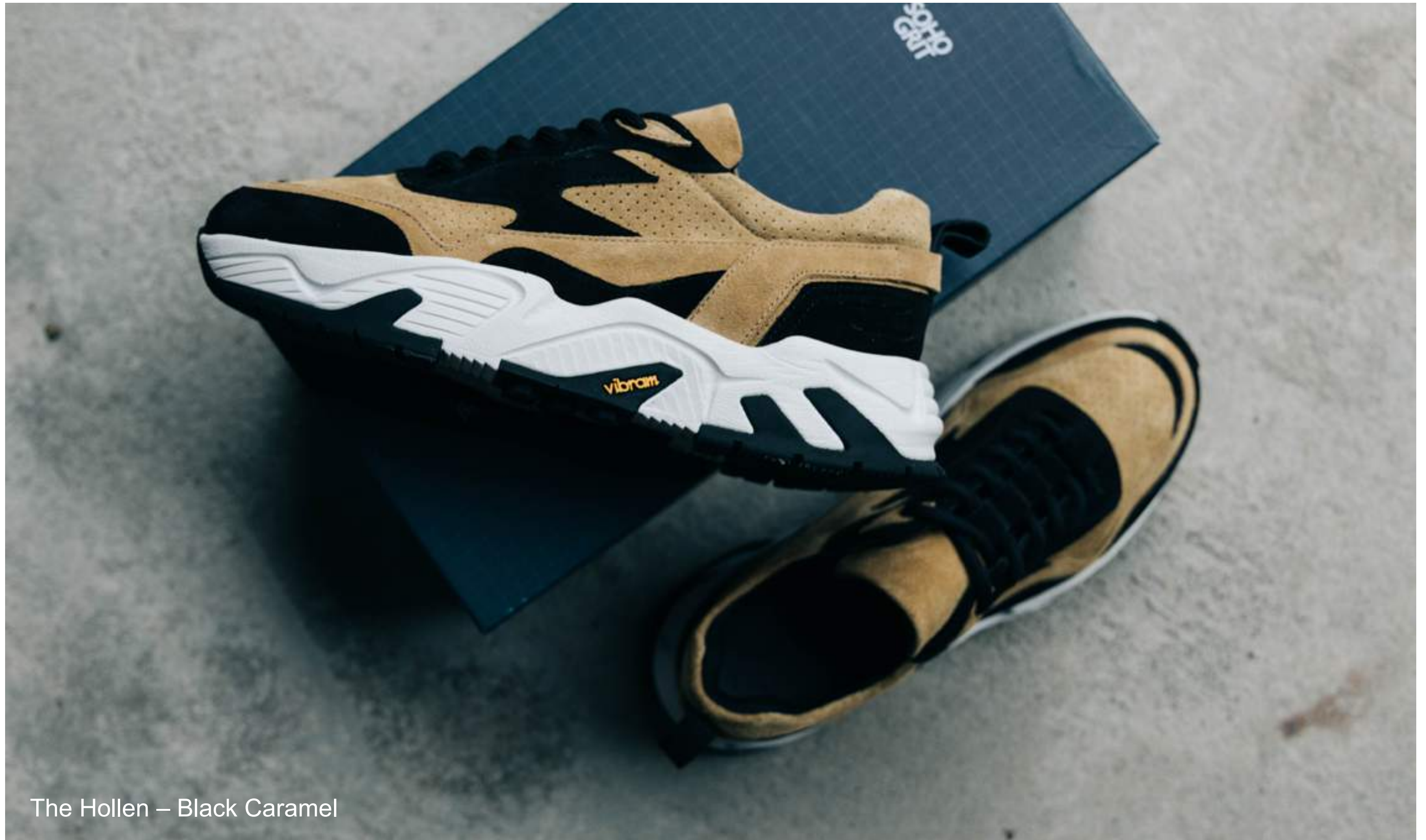
The Hollen – Black Caramel