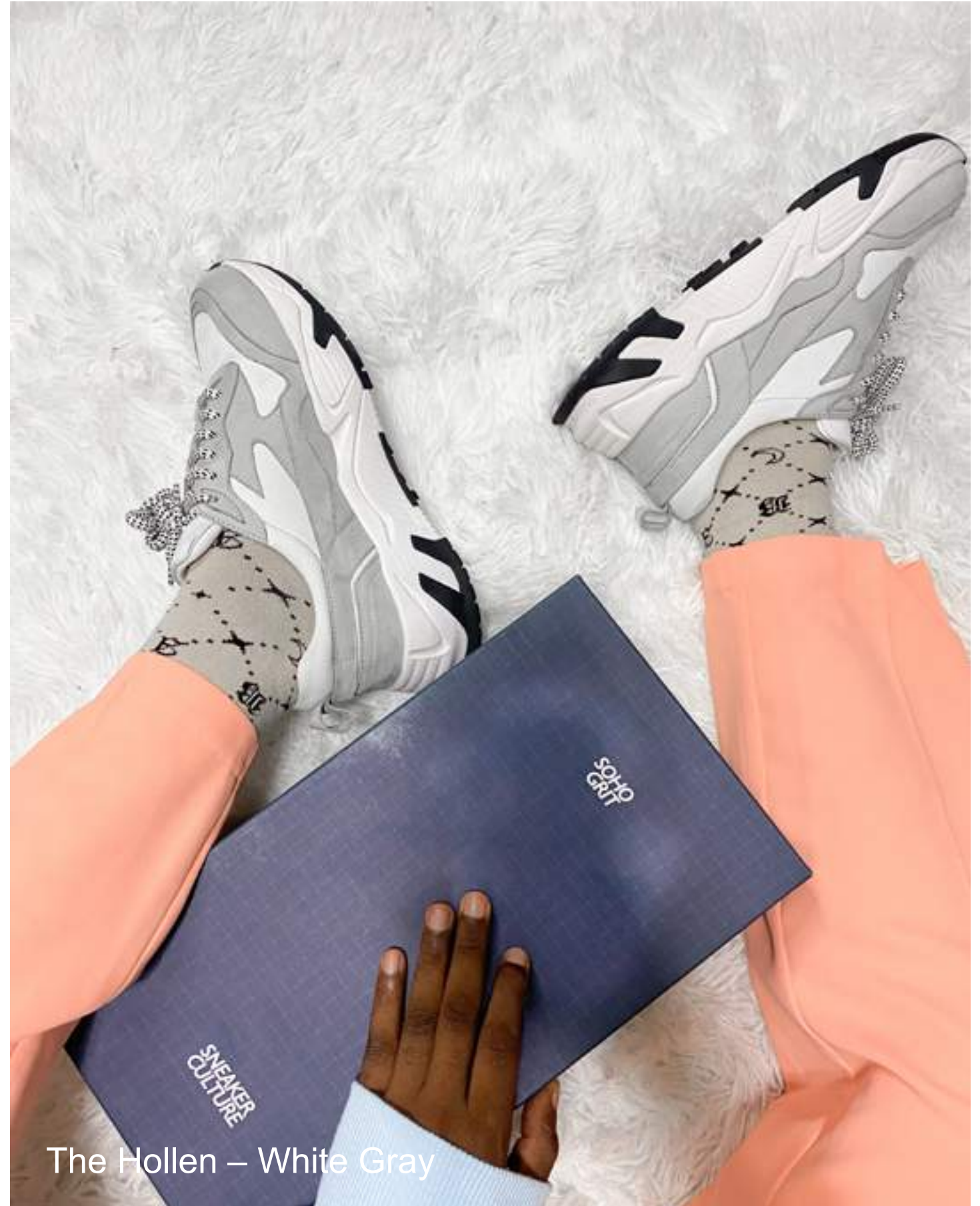
The Hollen – White Gray