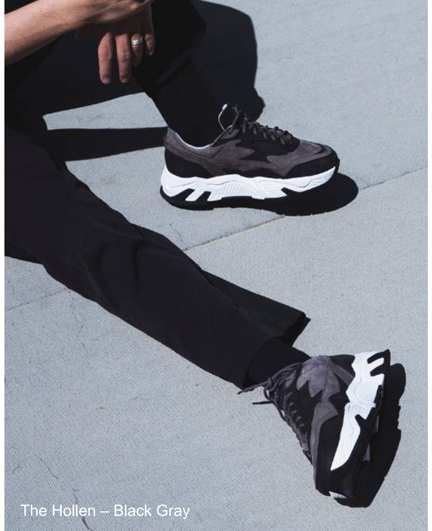
The Hollen – Black Gray