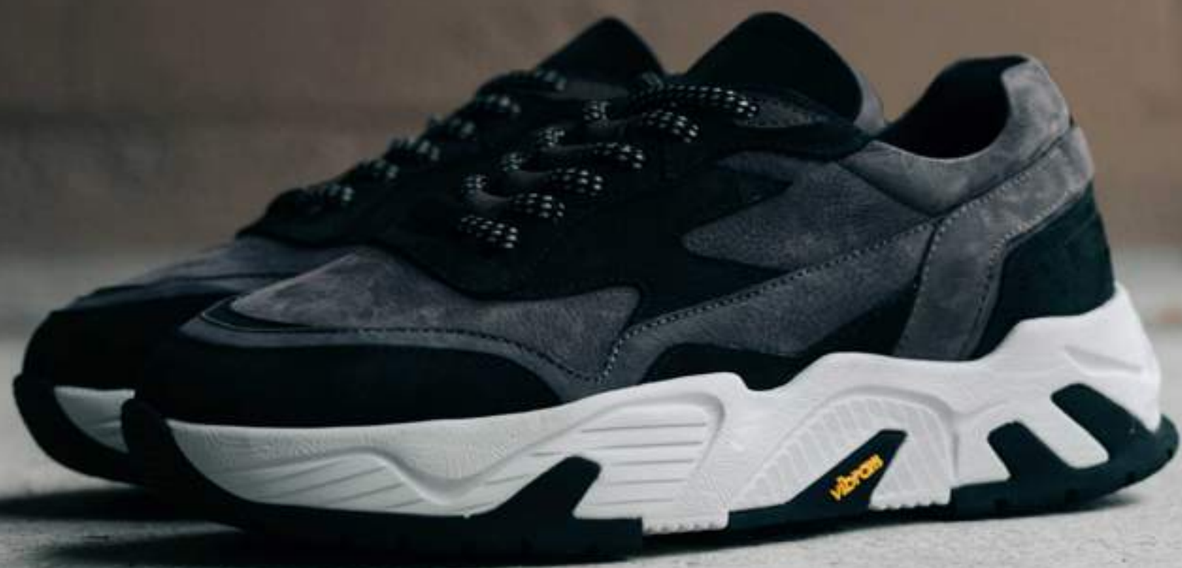
The Hollen – Black Gray