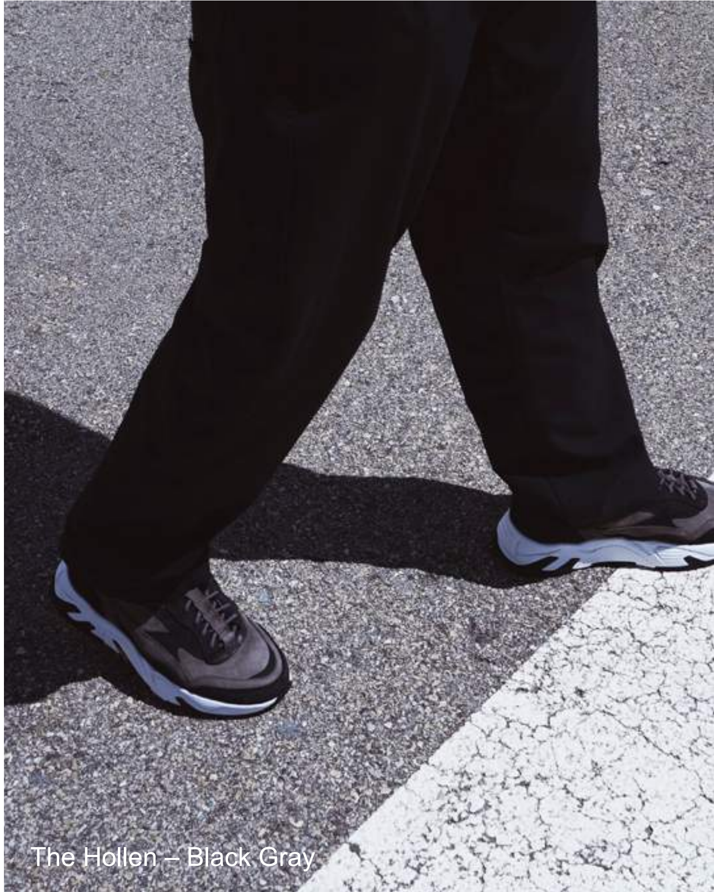
The Hollen – Black Gray