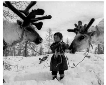
Ewenki people and reindeer