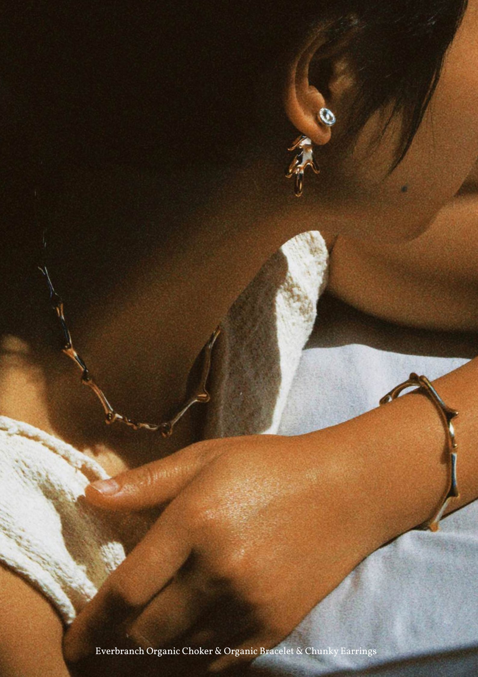
Everbranch Organic Choker & Organic Bracelet & Chunky Earrings