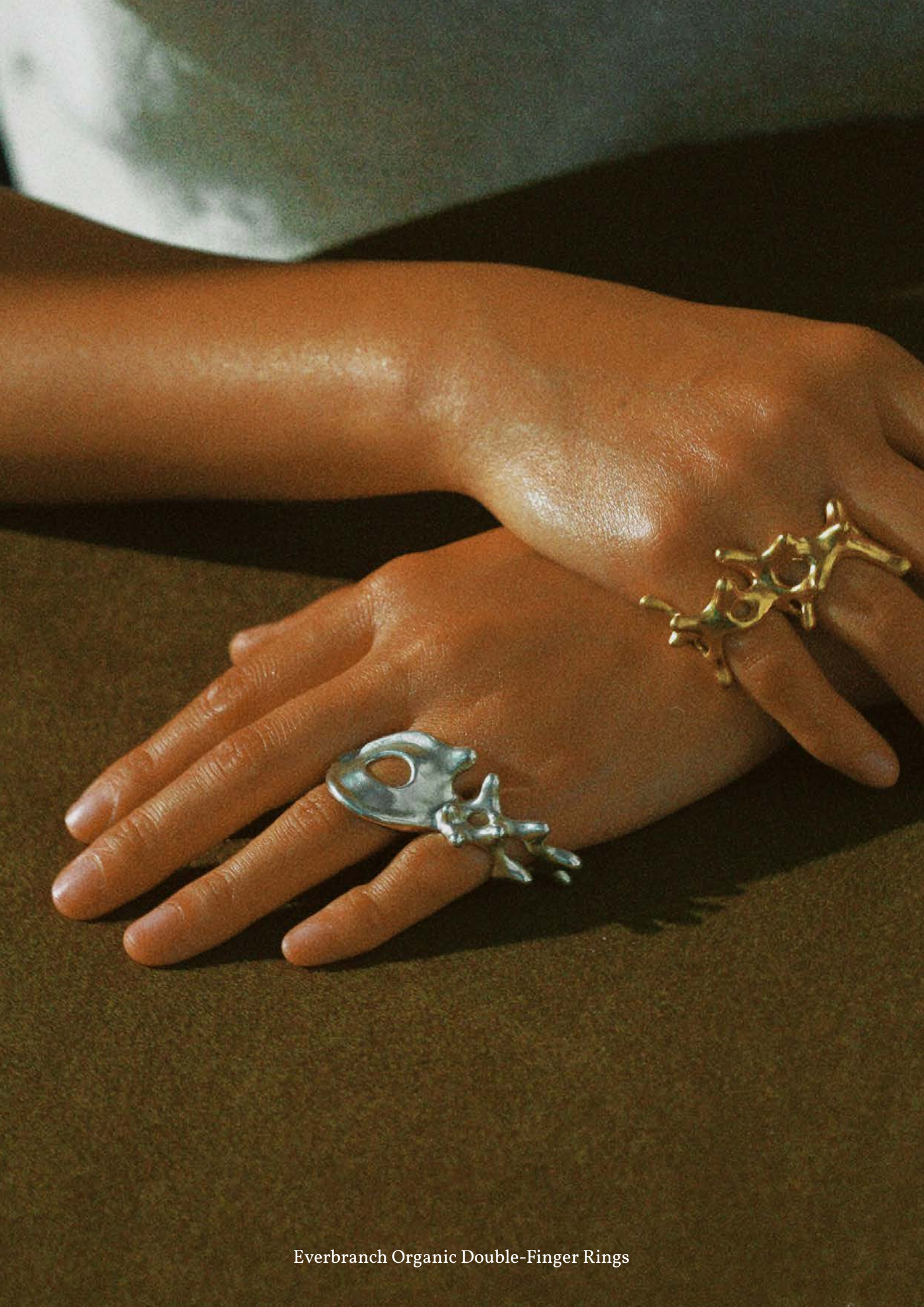
Everbranch Organic Double-Finger Rings