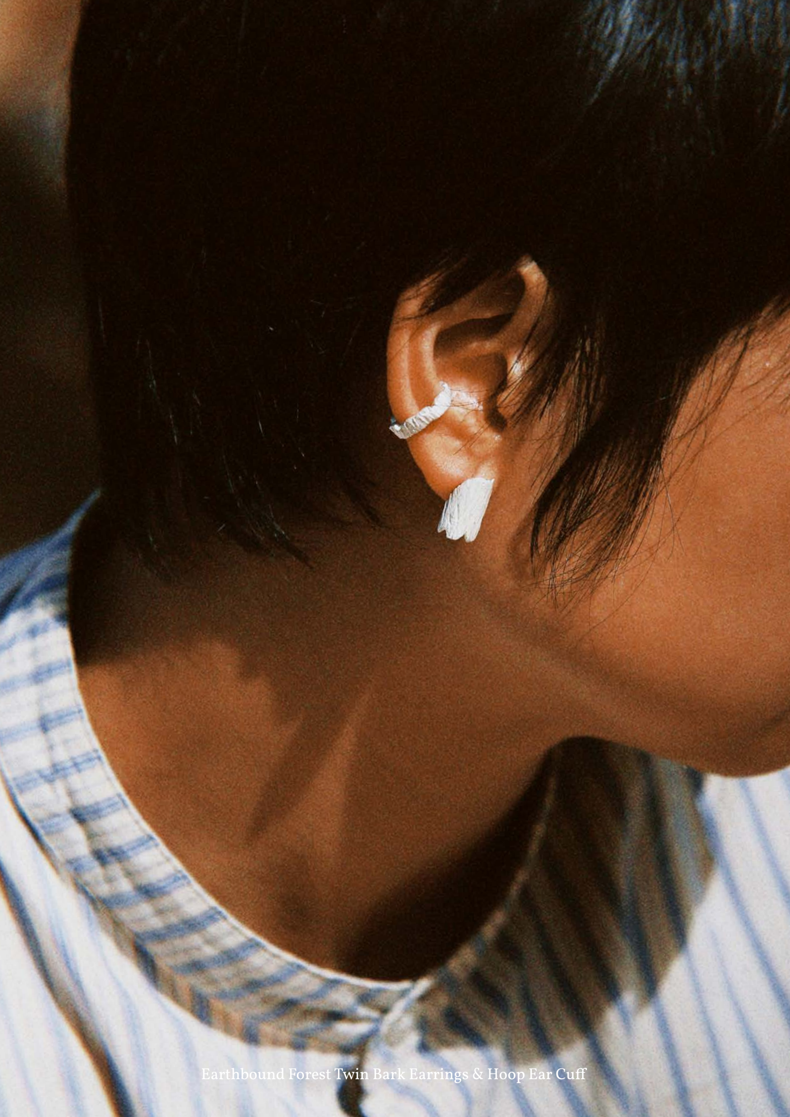
Earthbound Forest Twin Bark Earrings & Hoop Ear Cuff