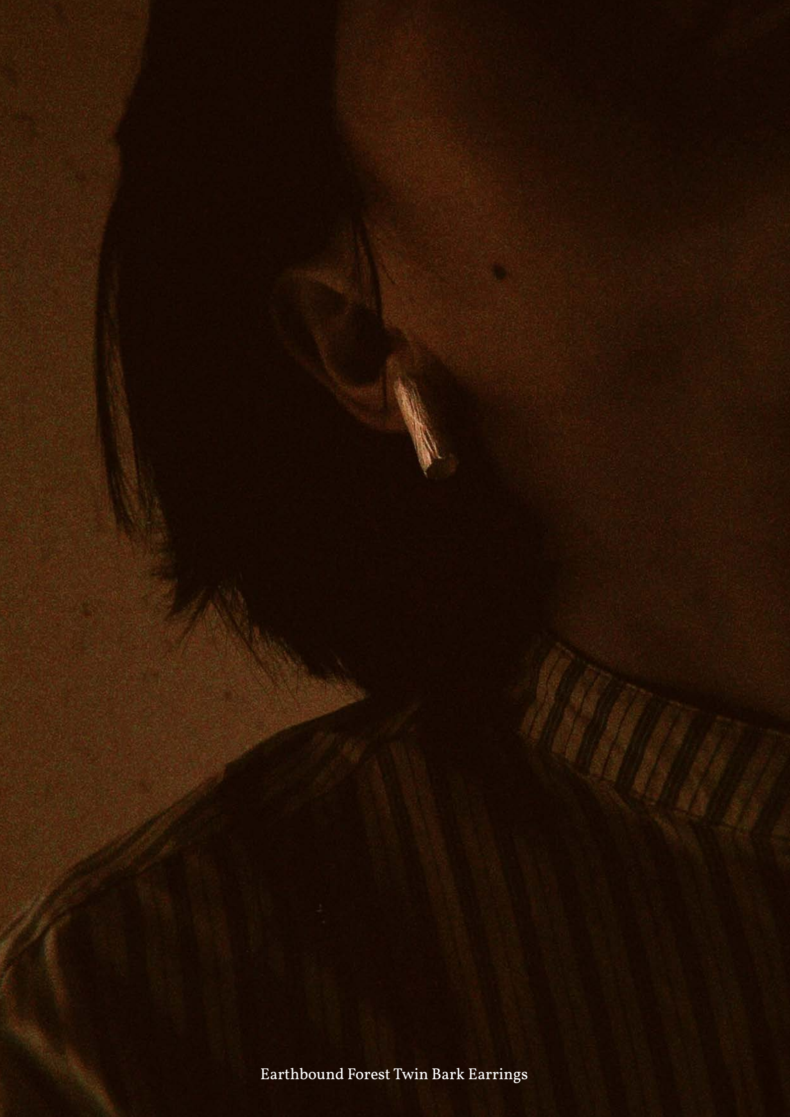
Earthbound Forest Twin Bark Earrings