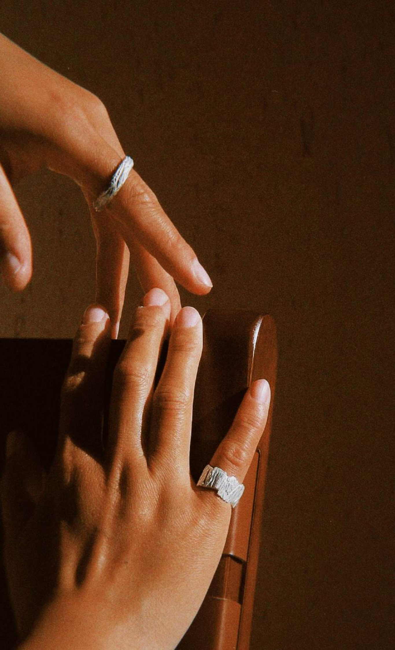
Earthbound Forest Bark Round Ring & Pinky Thick Ring