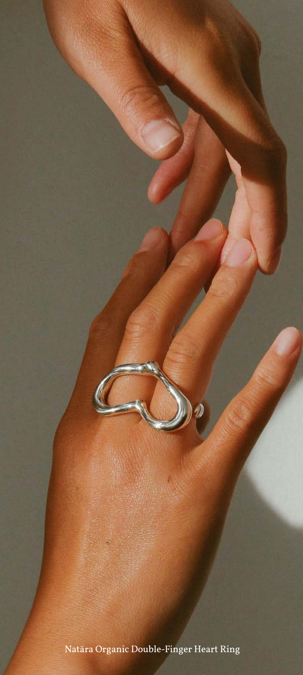
Natāra Organic Double-Finger Heart Ring