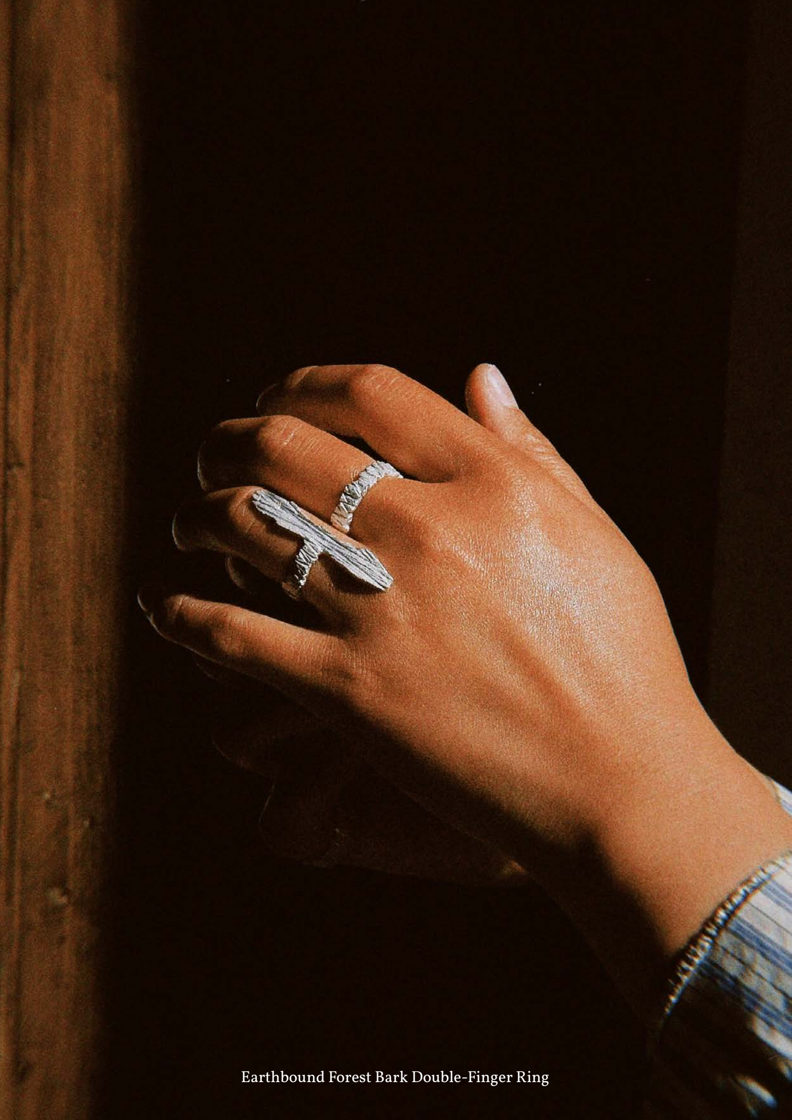
Earthbound Forest Bark Double-Finger Ring