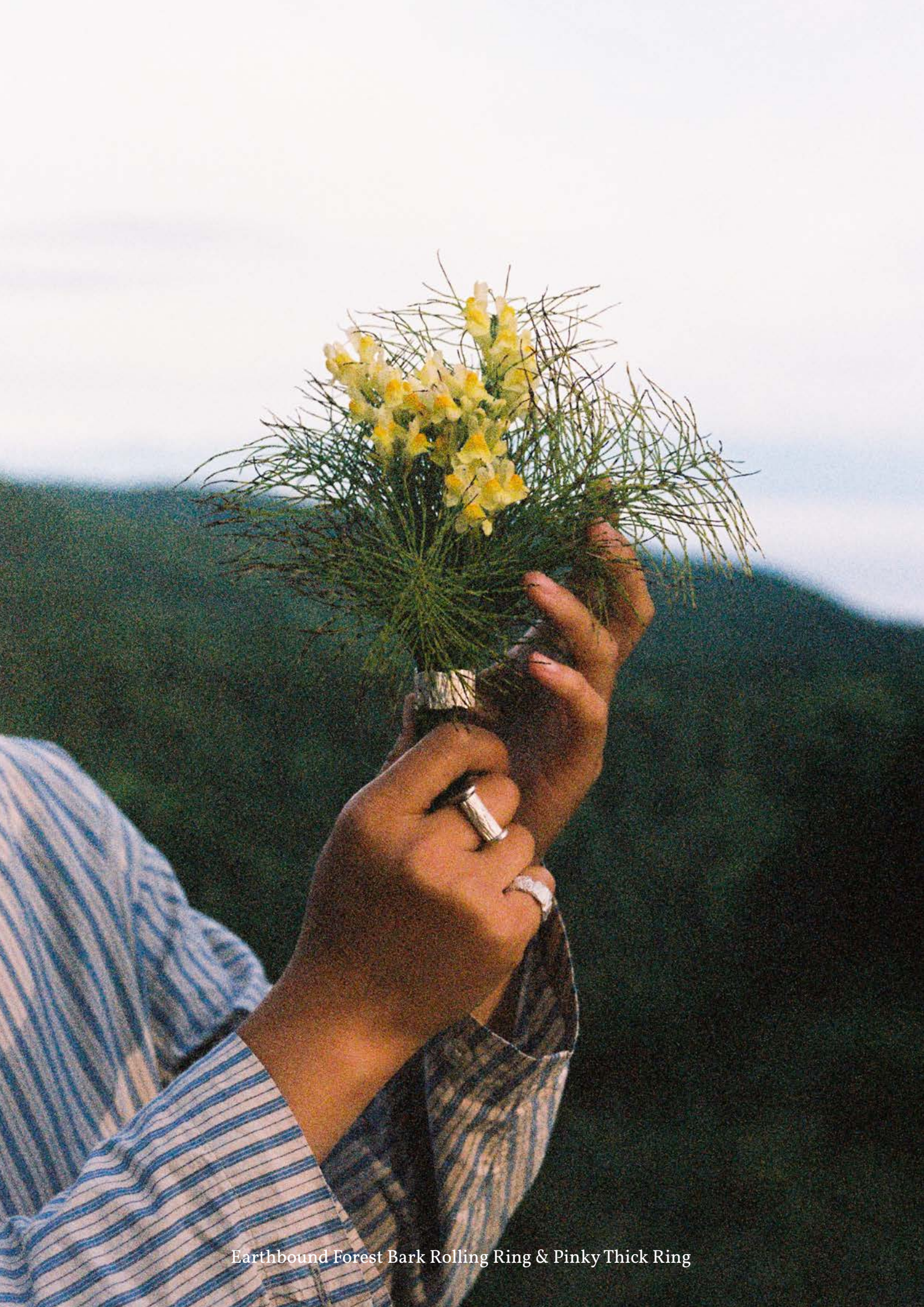
Earthbound Forest Bark Rolling Ring & Pinky Thick Ring