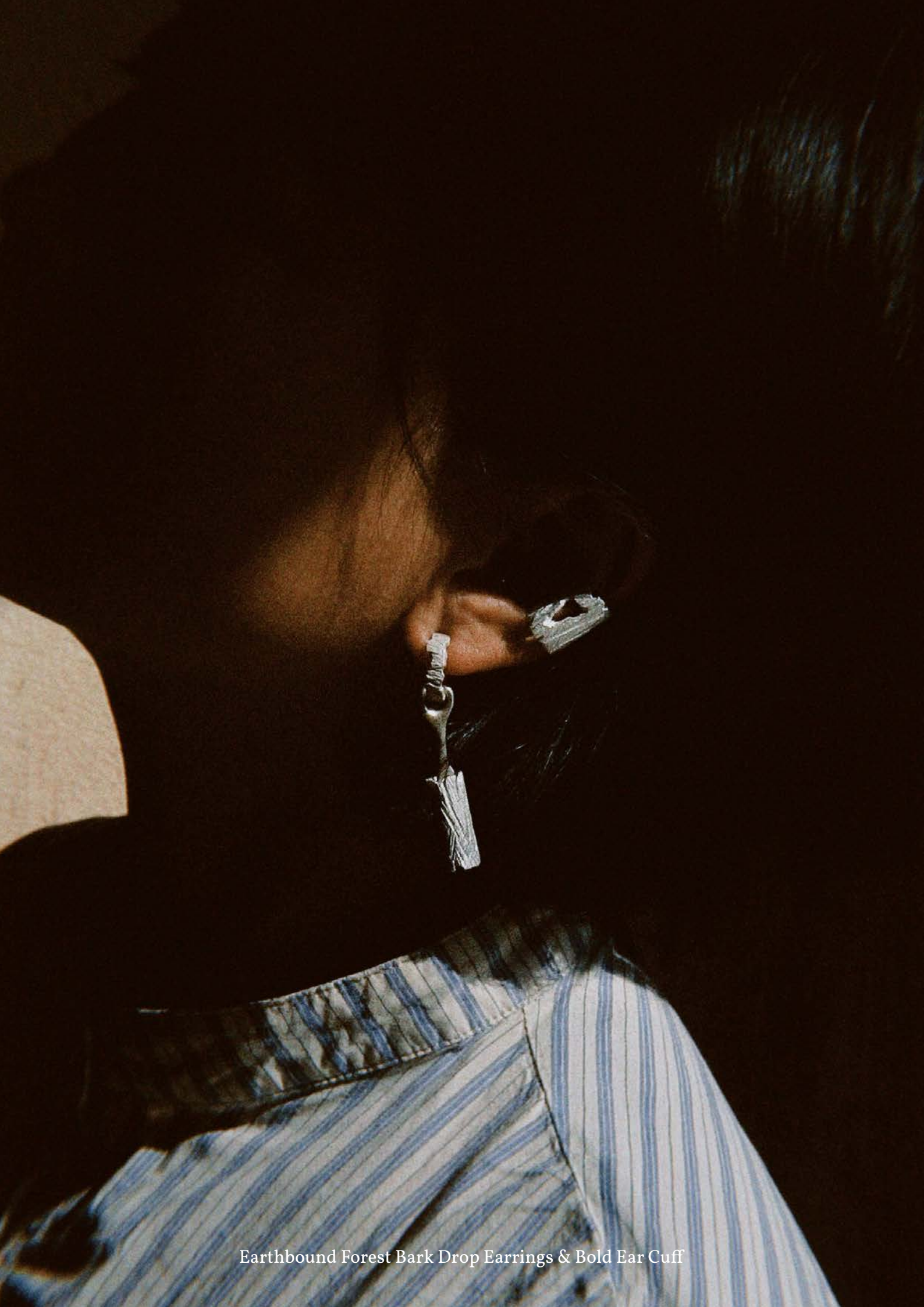
Earthbound Forest Bark Drop Earrings & Bold Ear Cuff