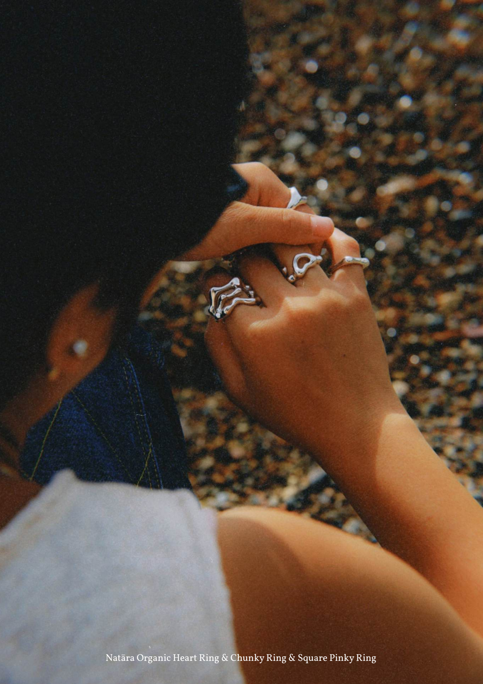
Natāra Organic Heart Ring & Chunky Ring & Square Pinky Ring