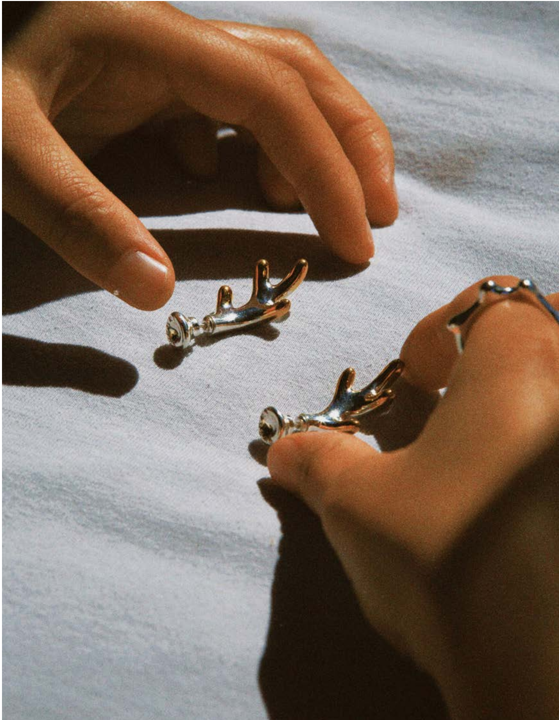
Everbranch Chunky Earrings & Organic Ring