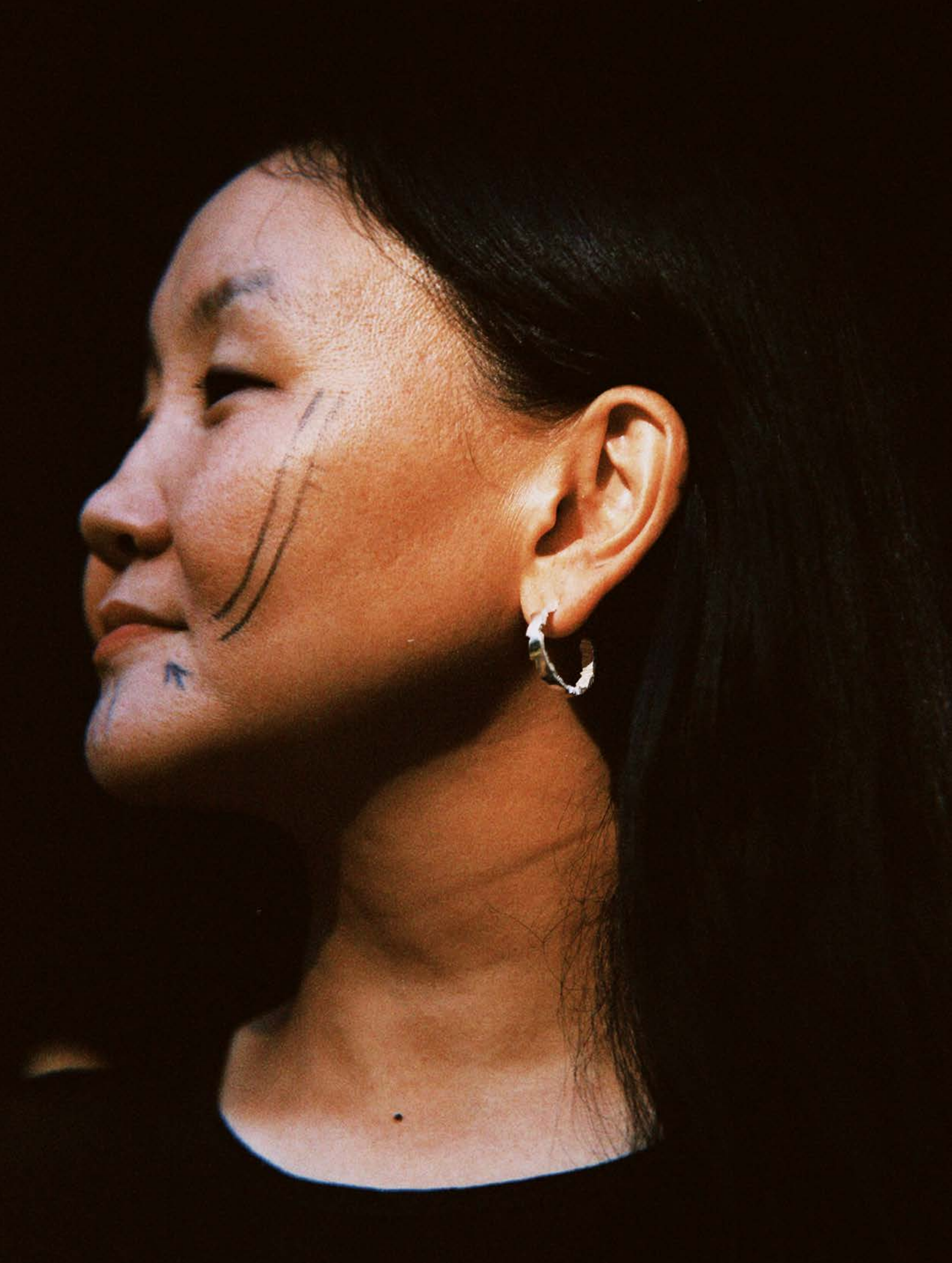
Earthbound Forest Bark Medium Hoops