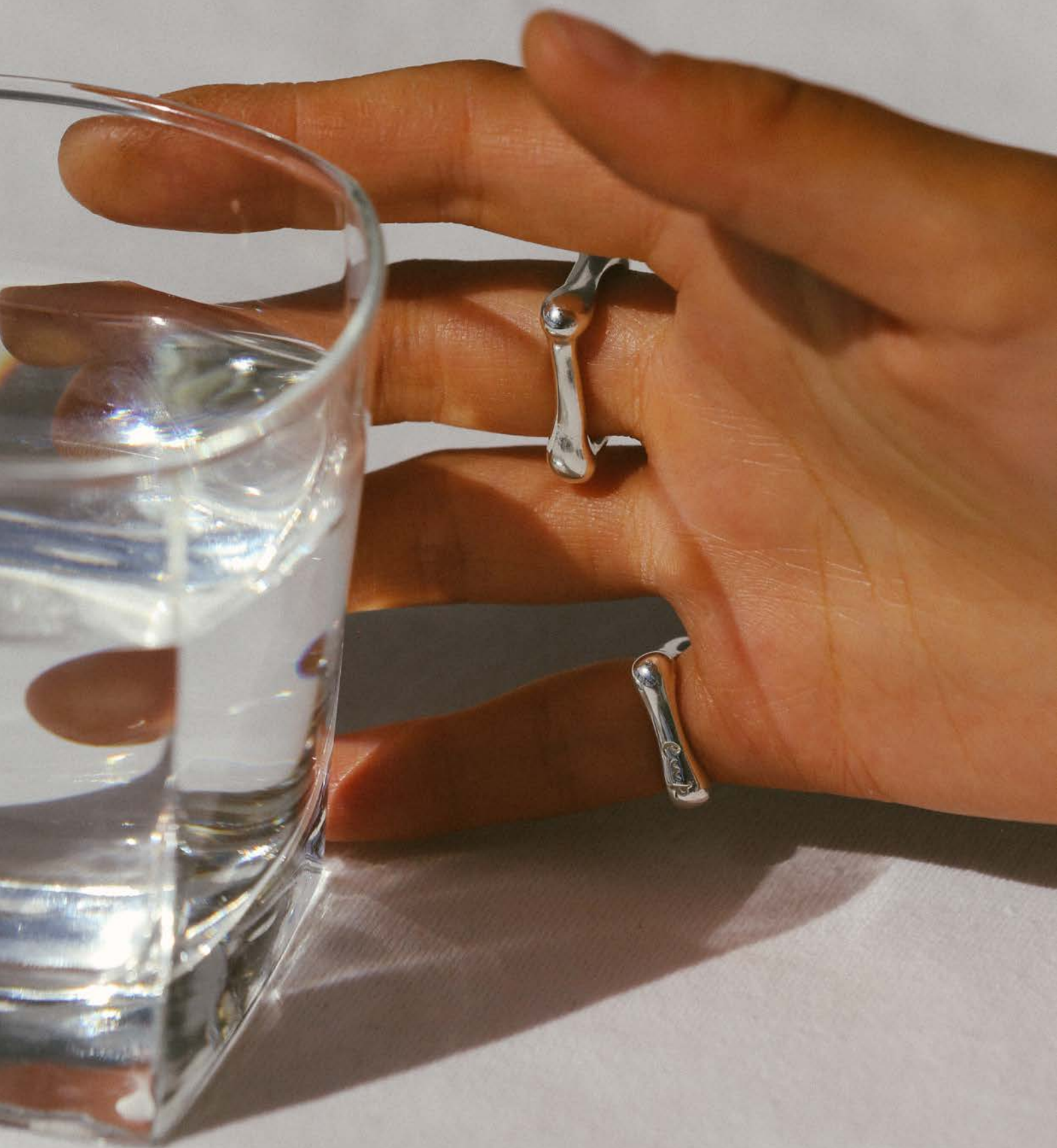
Natāra Organic Square Ring & Pinky Square Ring