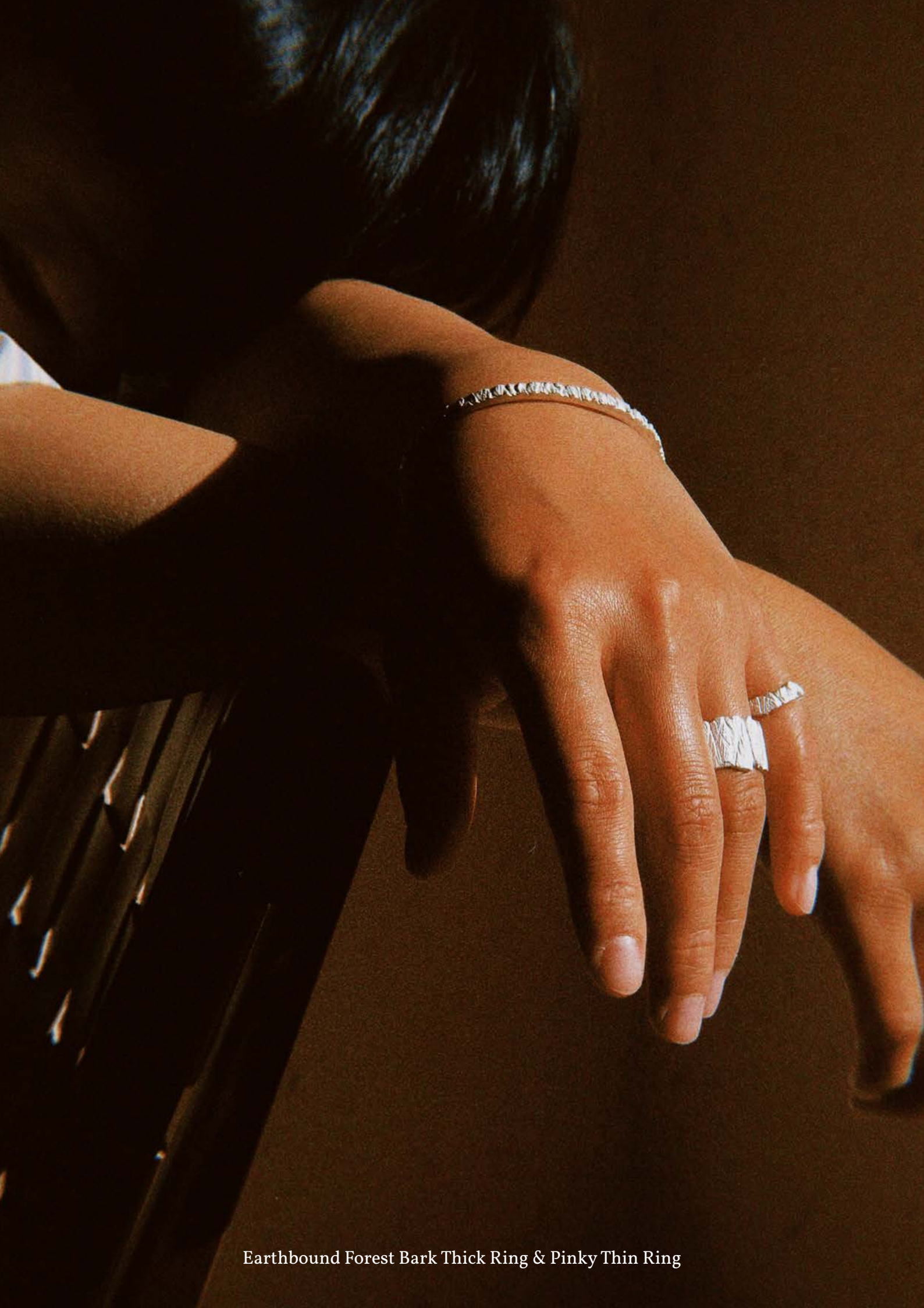
Earthbound Forest Bark Thick Ring & Pinky Thin Ring