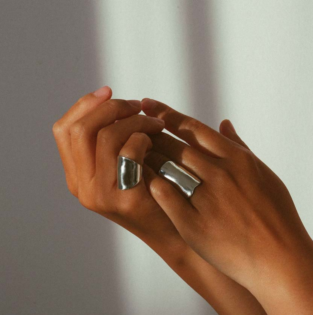
Natāra Groundform Long Ring & Pinky Ring