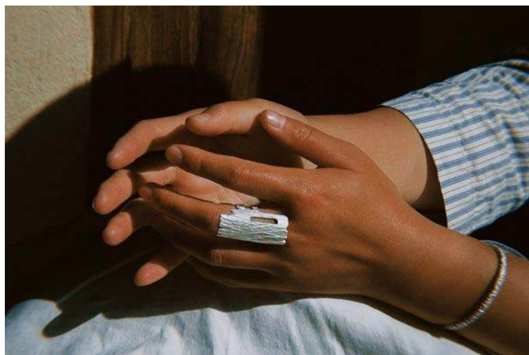
Earthbound Forest Bark Long Ring