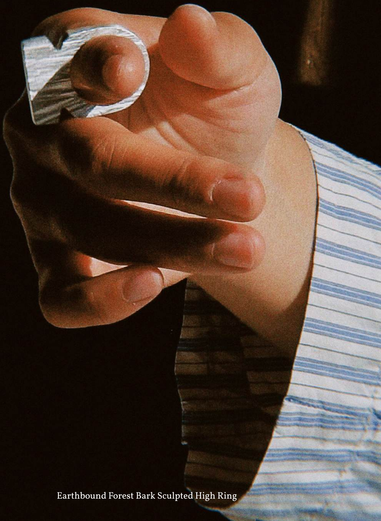
Earthbound Forest Bark Sculpted High Ring