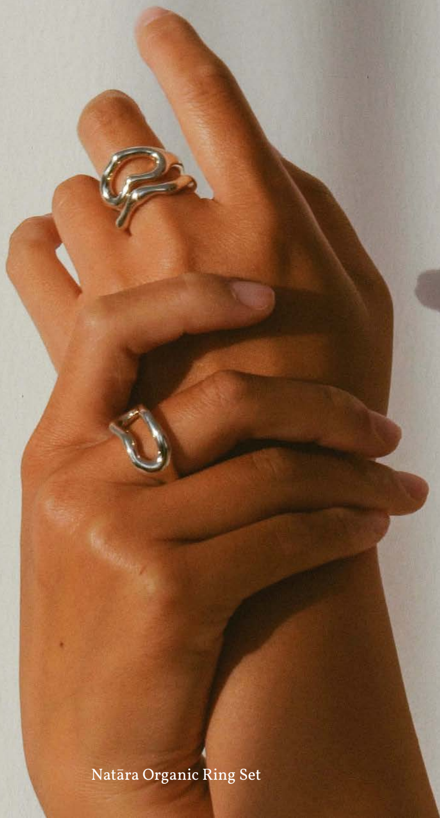
Natāra Organic Ring Set