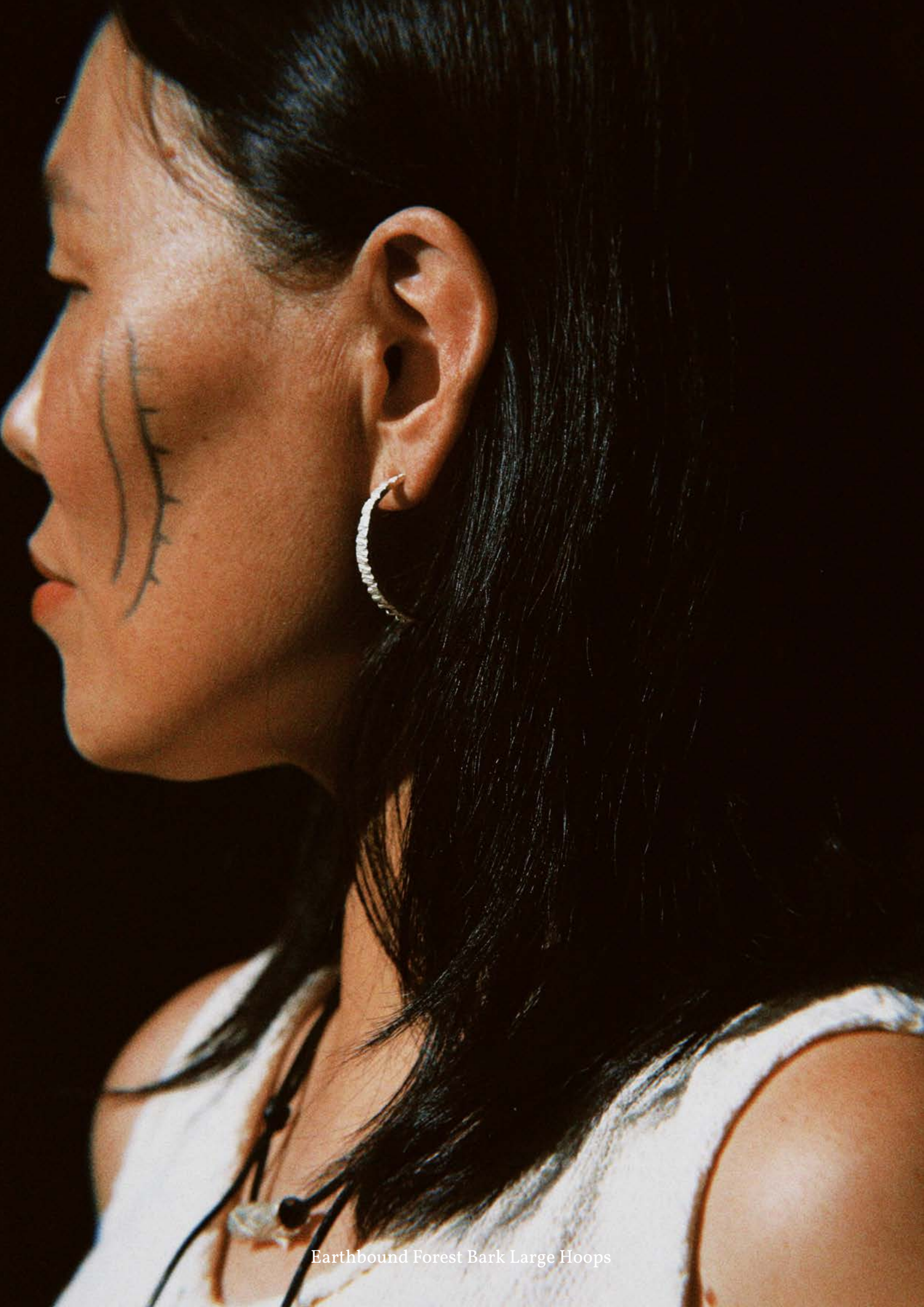
Earthbound Forest Bark Large Hoops