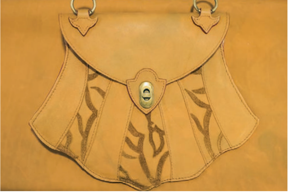
*2ND YEAR STUDENTS: AMELIA GEBRUERS [ABOVE]