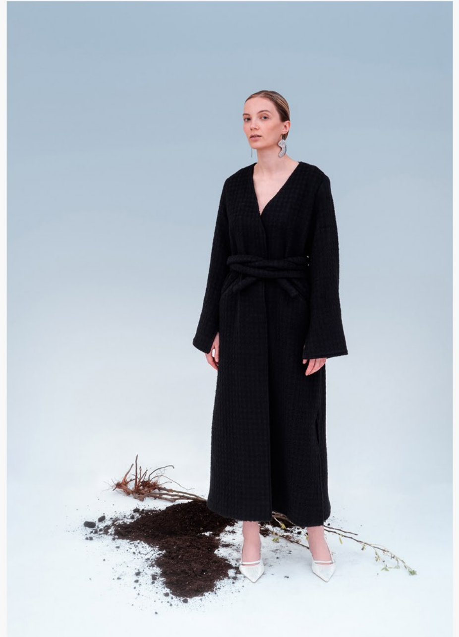
LOOK 4 — TEXTURED COAT WITH AN EXTRA LONG BELT AND WOOL SUIT.