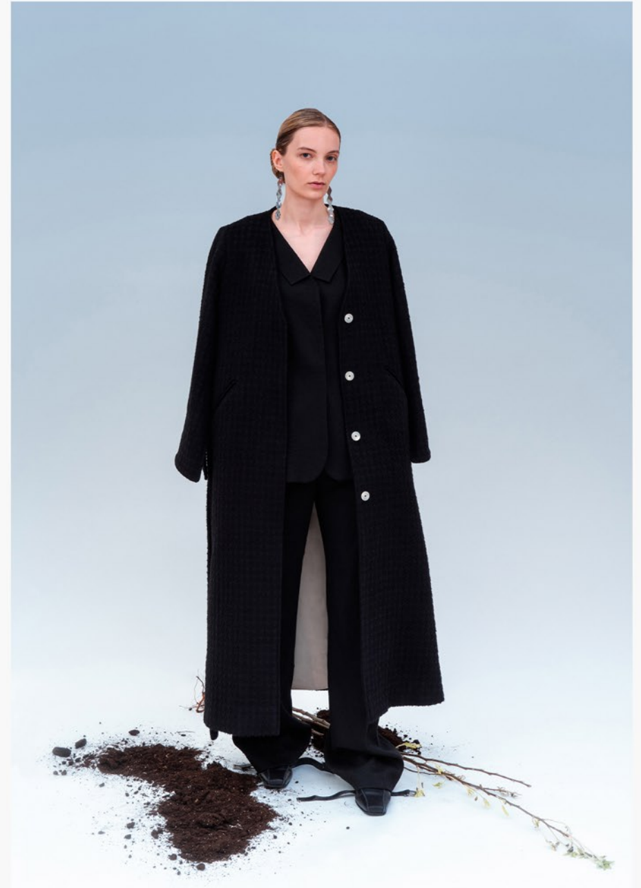
LOOK 3 — TEXTURED WOOL JACKET WITH CURVED SLEEVES AND FOLDED COLLAR, PANTS WITH SHARPLY PRESSED PLEATS THROUGH THE STRAIGHT LEGS.