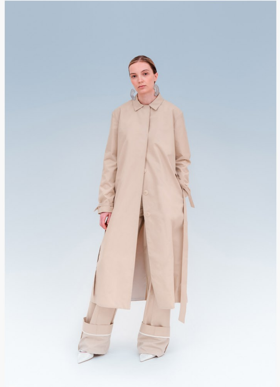
LOOK 2 — TRENCHCOAT SUIT. TRADITIONAL WOOLEN SHAWL IS WORN OVER THE 'WREATH' HEAD ACCESSORY.