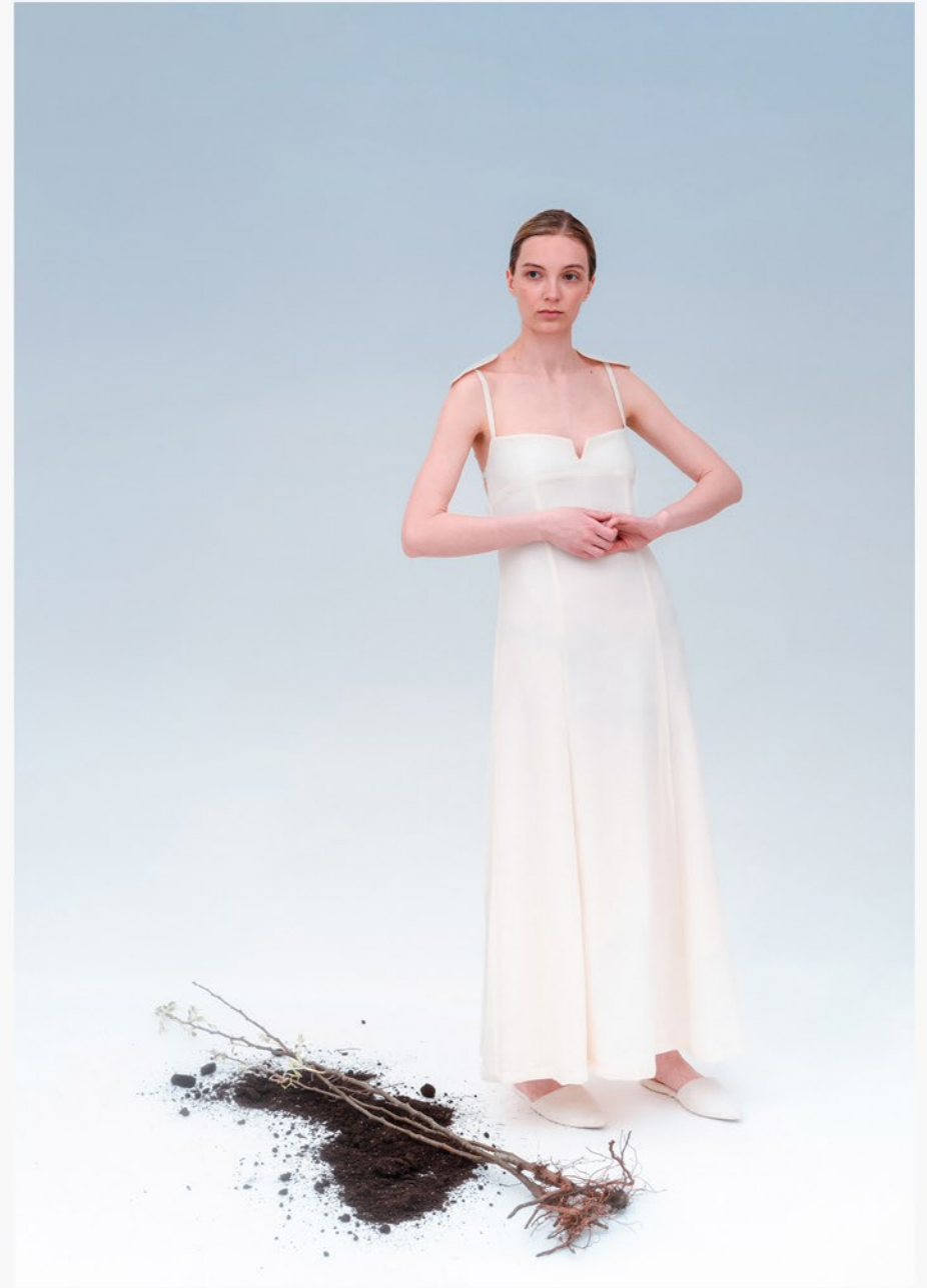
LOOK 5 — V-NECK DRESS WITH THE APPLIED 'PETALS' ON THE SHOULDERS. 'PETALS' SHAPE COMES FROM THE BRONZE SCULPTURE 'SLEEPING MUSE' CREATED BY CONSTANTIN BRANCUSI.