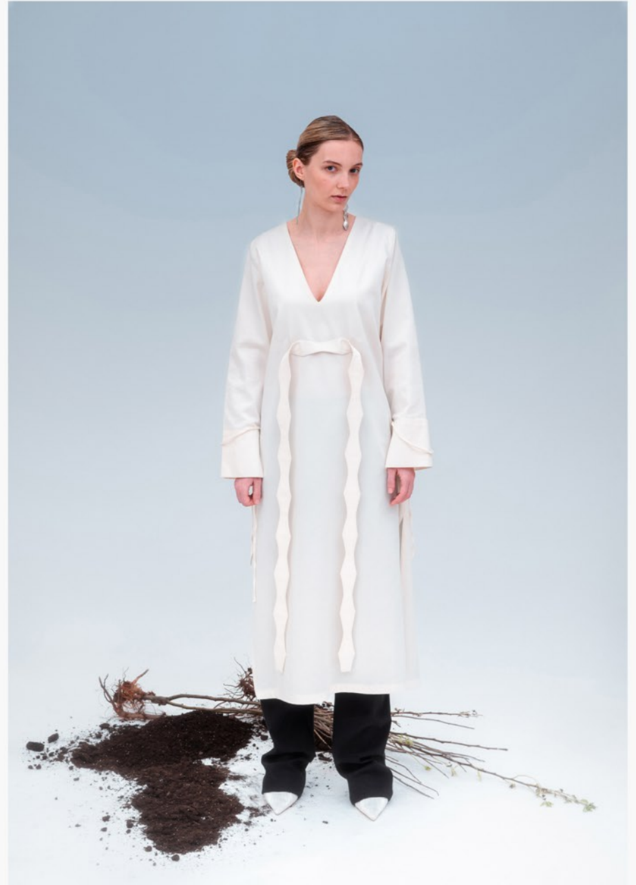
LOOK 7 — 'IA' DRESS WITH A SHAPED BELT. THE GEOMETRY OF THE BELT IS IMPRESSED BY THE WORK OF CONSTANTIN BRANCUSI 'ENDLESS COLUMN'.