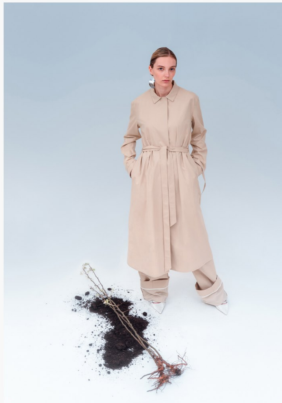
OK KINO METAL EARRINGS SHAPE COMES FROM THE BRONZE SCULPTURE 'SLEEPING MUSE' CREATED BY CONSTANTIN BRANCUSI.