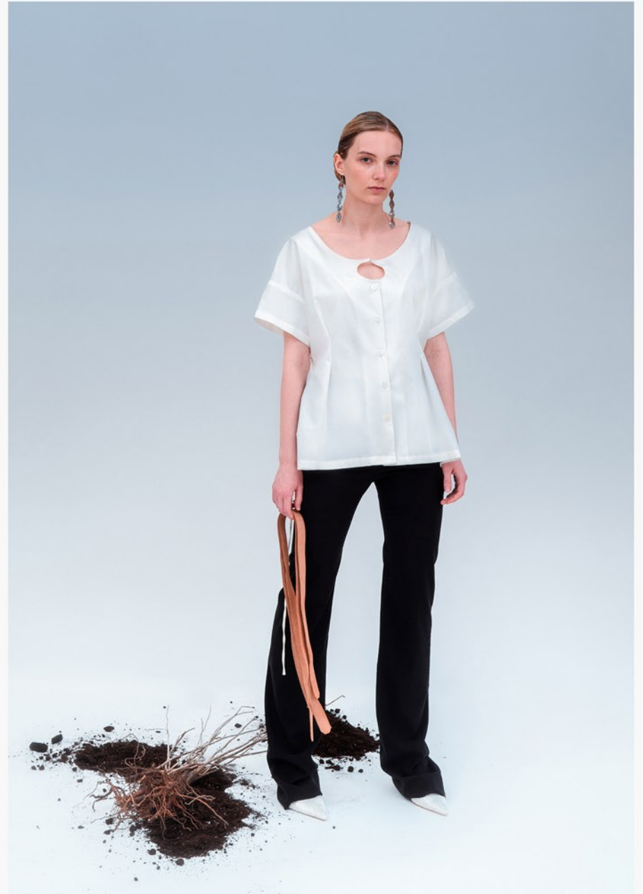
LOOK 8 — VOLUMINOUS BLOUSE WITH A FIGURED NECKLINE AND SLIM TROUSERS.