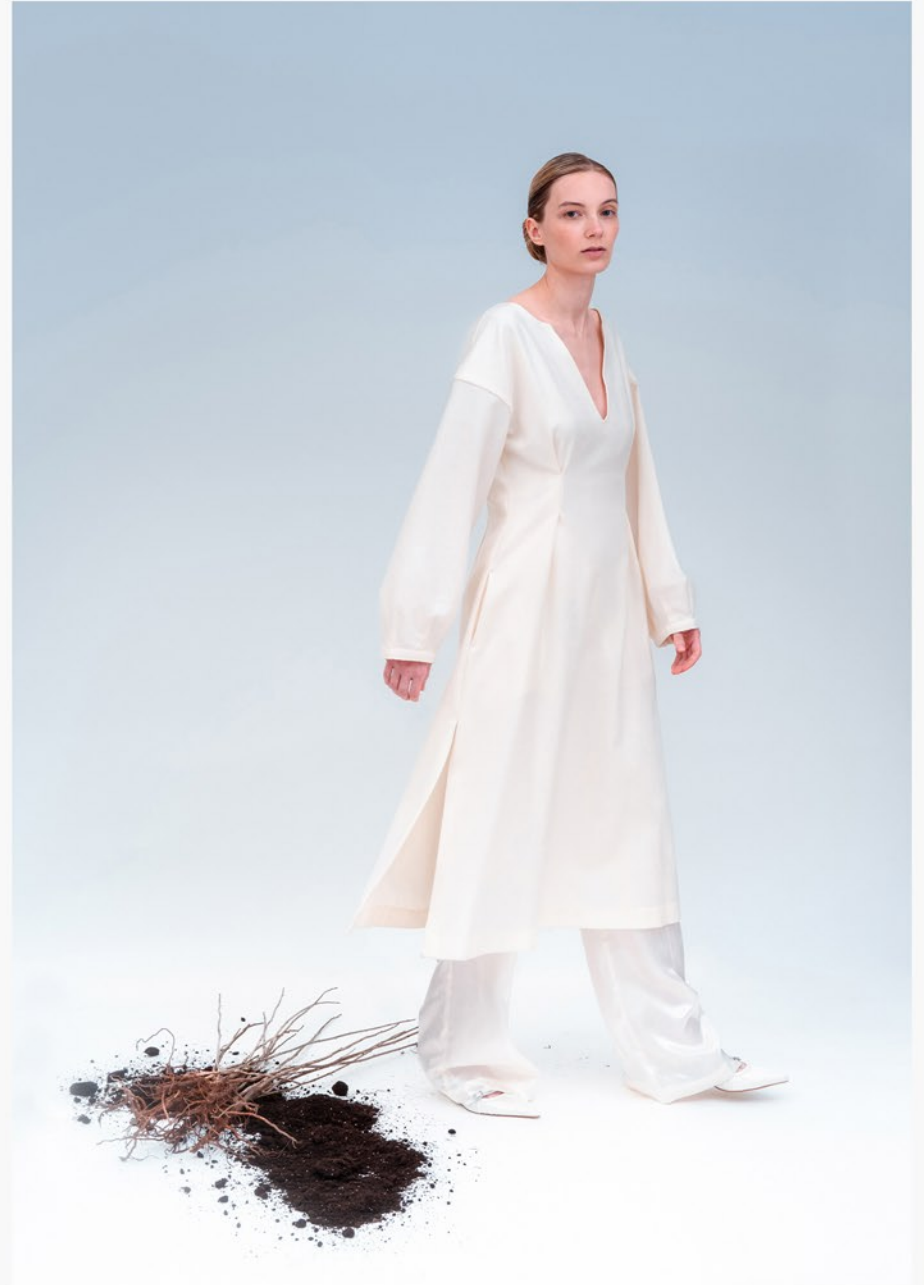
LOOK 1 — SCULPTURAL LIGHT WOOL DRESS WITH WIDE LEG SILK PANTS, BRANCUSI INSPIRED EARRINGS WITH UPCYCLED METAL.