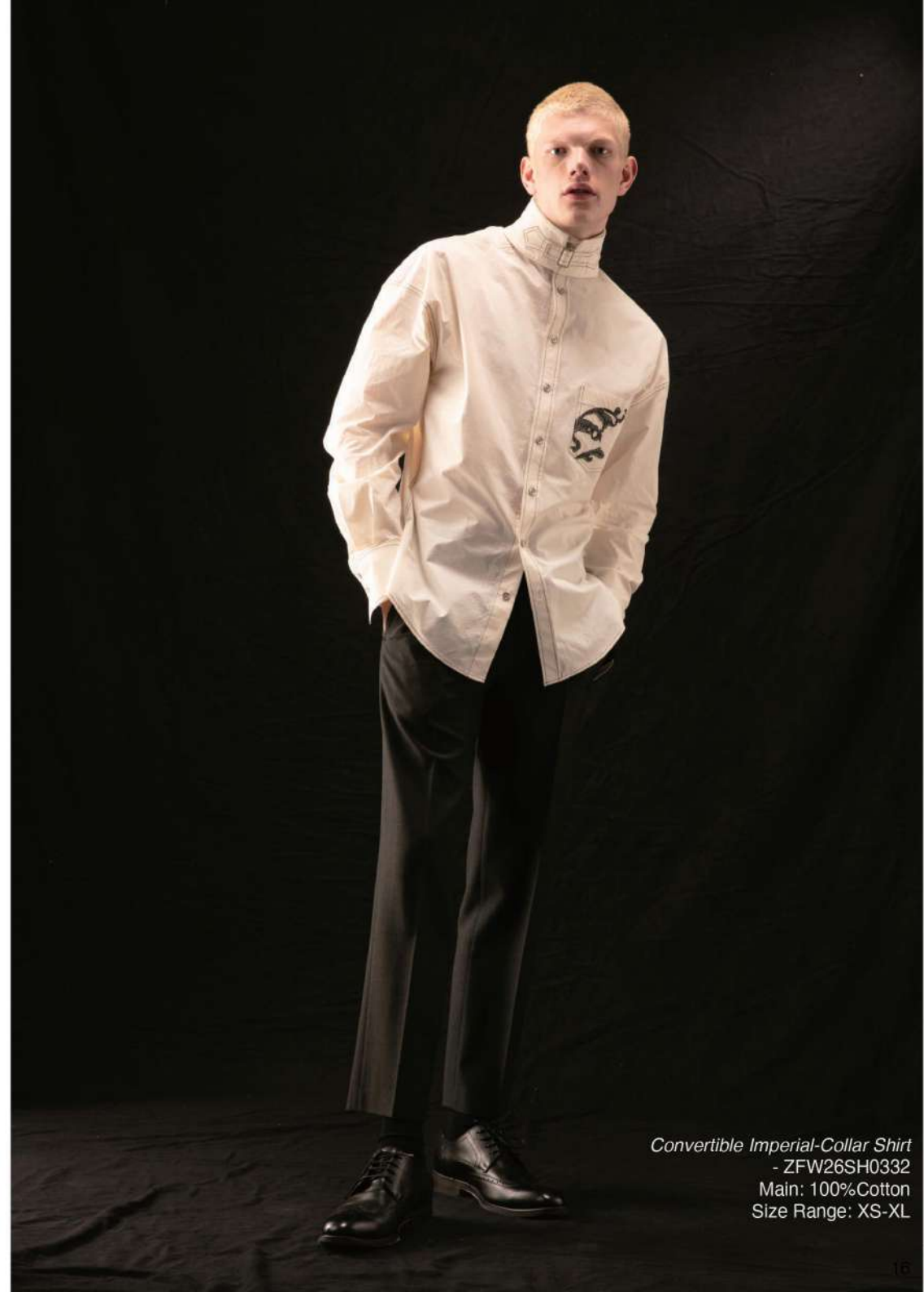
Convertible Imperial-Collar Shirt - ZFW26SH0332 Main: 100% Cotton Size Range: XS-XL