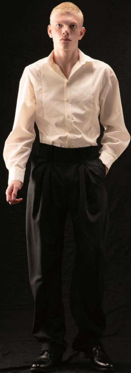
Running Stitch Panel Shirt - ZFW26SH0751 Main: 100% Cotton Size Range: XS-XL