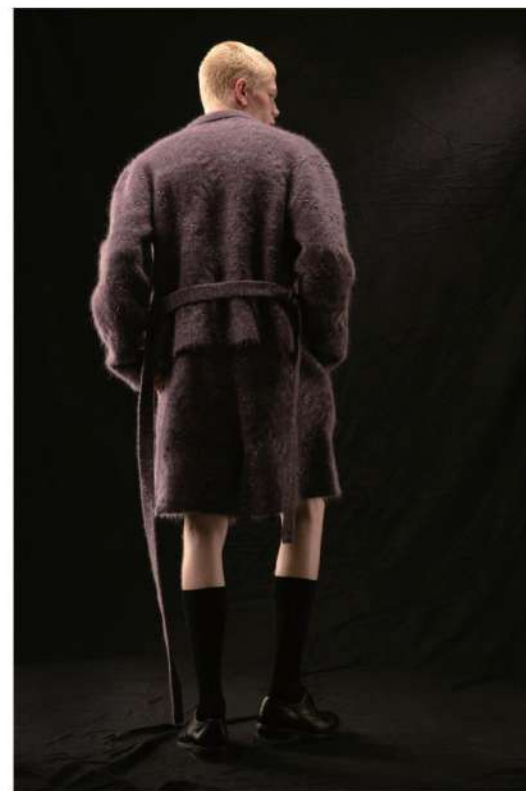
Brushed Argyle Cardigan - ZFW26KN0303 Main: 59% Alpaca, 25% Acrylic, 15% Nylon, 1% Spandex Size Range: XS-XL