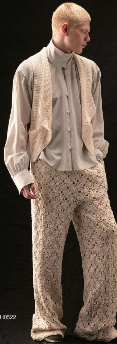
Renaissance Shirt - ZFW26SH0522 Main: 100% Lyocell Size Range: XS-XL