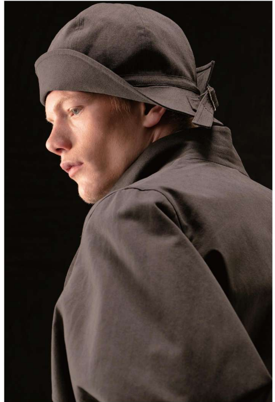
Twist-Brim Hat - ZFW26AS0102 Main: 56% Cotton, 30% Rayon, 14% Linen Size Range: S-L