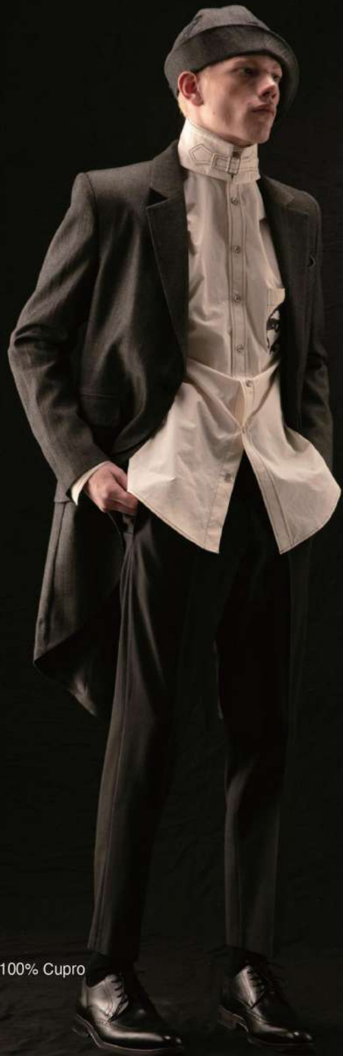
Layered Morning Jacket - ZFW26JKT0304 Shell: 100% Wool / Lining: 100% Cupro Size Range: XS-XL