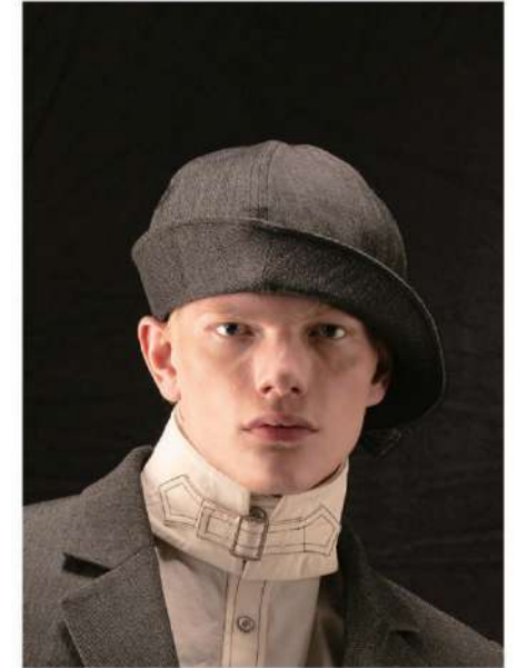
Ricamo Twist-Brim Hat - ZFW26AS0104 Main: 100% Wool Size Range: S-L