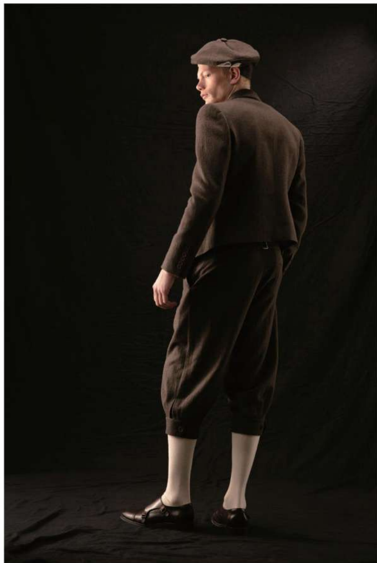
Tailored Back Buckle Knickerbockers - ZFW26TR0103 Main: 95%Wool, 5% Silk Size Range: XS-XL