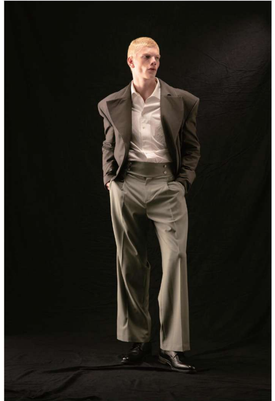
Oversized Cropped Wide Shoulder Jacket - ZFW26JKT0606 Shell: 65% Wool, 35% Polyester / Lining: 100% Cotton Size Range: XS-XL