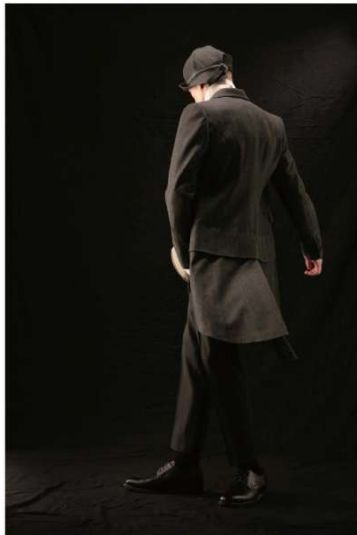
Layered Morning Jacket - ZFW26JKT0304 Shell: 100% Wool / Lining: 100% Cupro Size Range: XS-XL