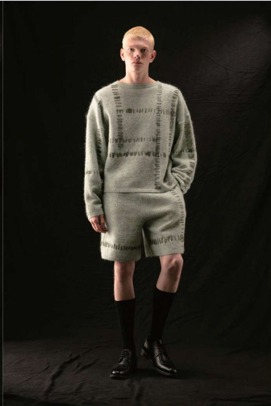
Windowpane Brushed Jumper - ZFW26KN0202 Main: 55%Alpaca 15%Wool 24%Nylon 6% Spandex Size Range: XS-XL