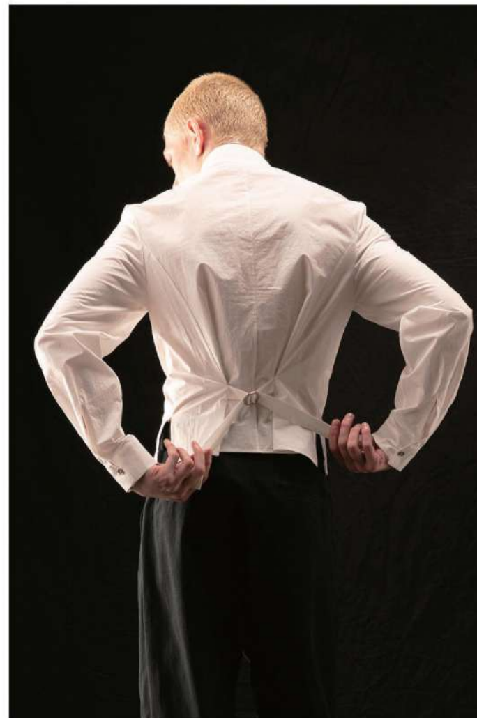
Fioretto Shirt - ZFW26SH0441 Main: 35% Pima Cotton, 65% Aussie Cotton Size Range: XS-XL