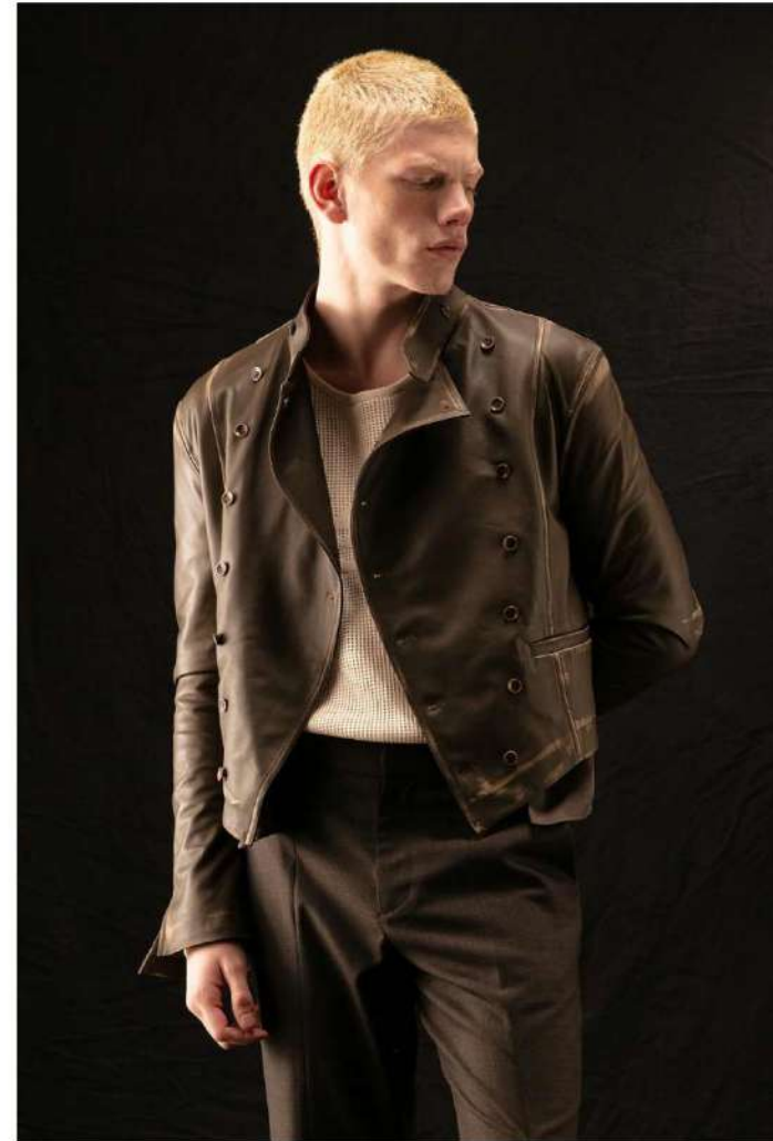
Military Distressed Leather Jacket - ZFW26JKT0411 Main: 100% Lambskin / Secondary: 100% Tencel Size Range: XS-XL