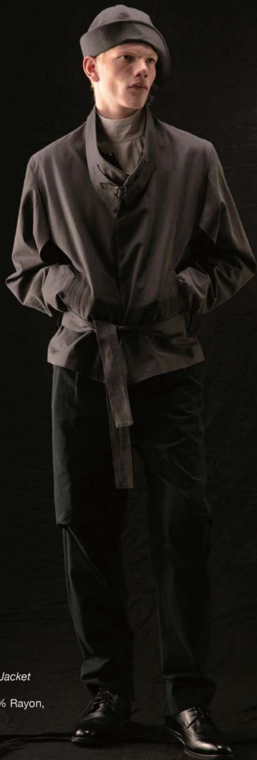
Deconstructed Trench Jacket - ZFW26JKT0102 Main: 56% Cotton, 30% Rayon, 14% Linen Size Range: XS-XL