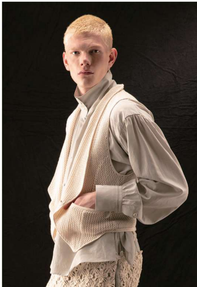
Shawl Lapel Knit Waistcoat - ZFW26VS0101 Main: 60% Cotton, 20% Viscose, 15% Nylon, 5% Cashmere Size Range: XS-XL