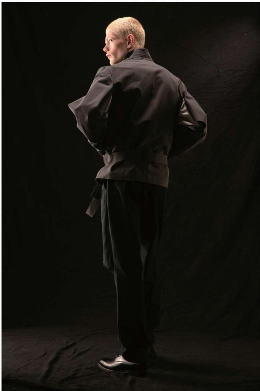
Sculpted Shin Twisted Trousers - ZFW26TR0602 Main: 56% Cotton, 30% Rayon, 14% Linen Size Range: XS-XL