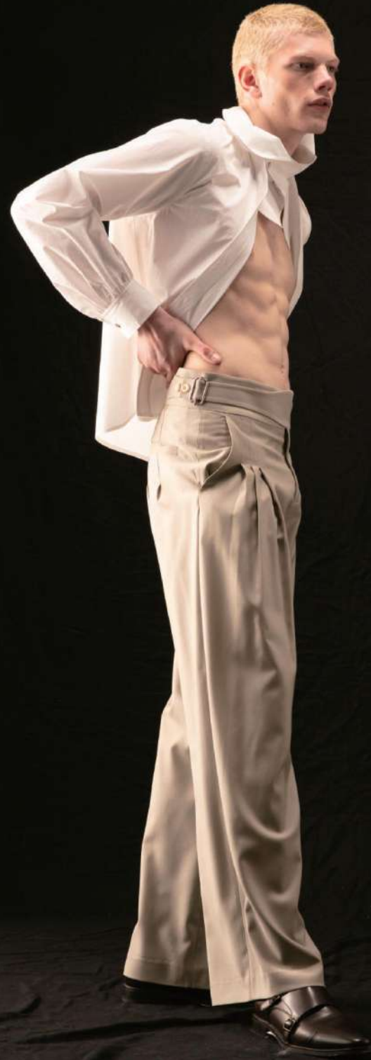
Triple-Pleat Side Buckle Strap Trousers - ZFW26TR0562 Main: 100%Wool Size Range: XS-XL