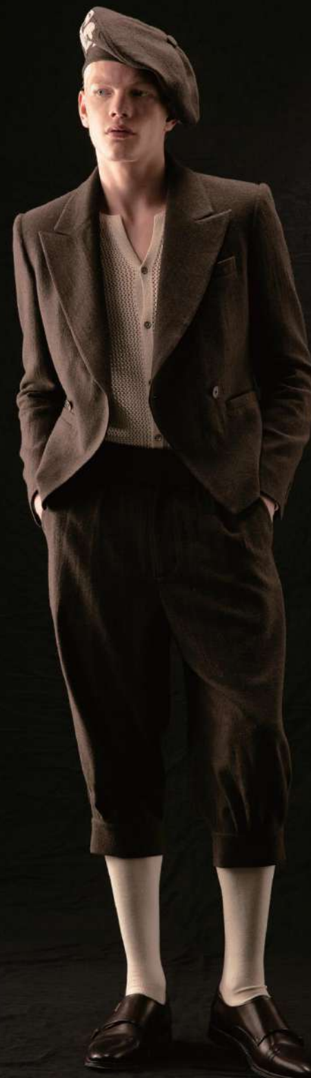
Double-Breasted Short Jacket - ZFW26JKT0203 Shell: 95% Wool, 5% Silk / Secondary: 100% Cupro Size Range: XS-XL