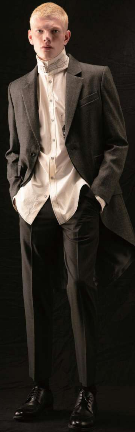
Pocket-Reveal Flap Trousers - ZFW26TR0307 Main: 50%Wool 50%Polyester Size Range: XS-XL