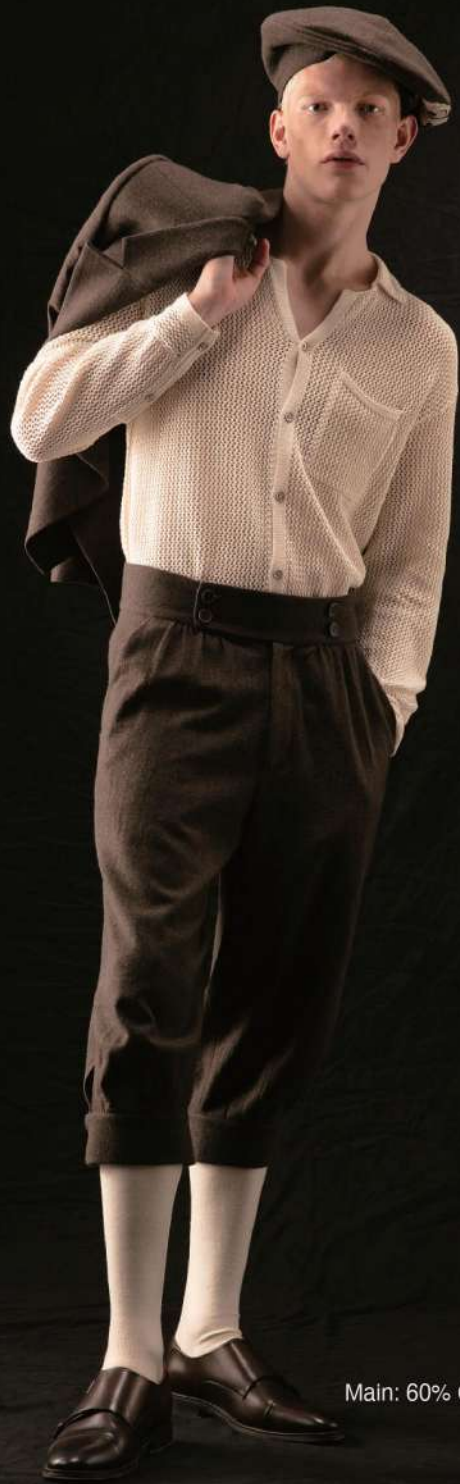
Textured Knit Relaxed Shirt - ZFW26KN0101 Main: 60% Cotton, 20% Viscose, 15% Nylon, 5% Cashmere Size Range: XS-XL