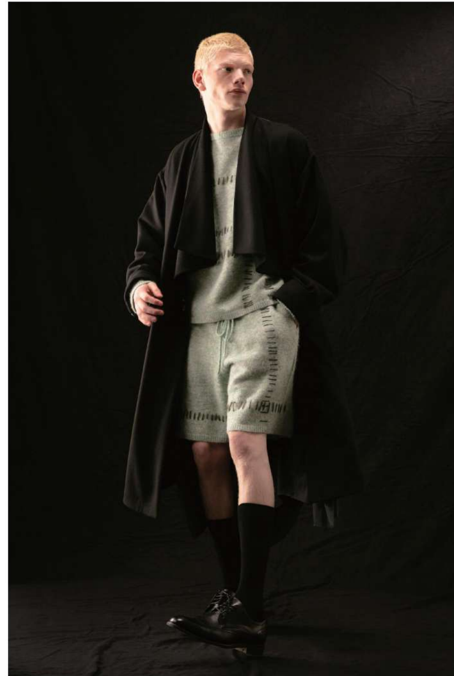
Back-Draped Long Coat - ZFW26CT0101 Shell: 100% Wool / Secondary: 31% Nylon, 69% Rayon Size Range: XS-XL