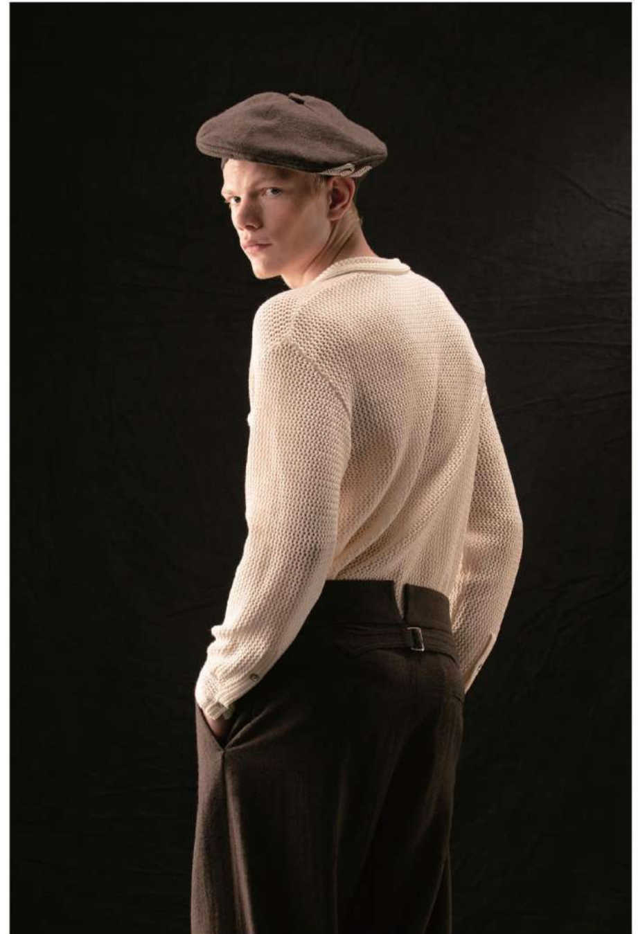
Ricamo Beret - ZFW26AS0203 Main: 95% Wool, 5% Silk Size Range: S-L