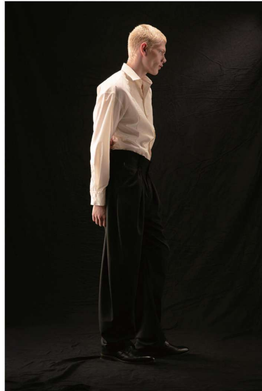
High Waisted Gathered Draped Trousers - ZFW26TR0771 Main: 60% Wool, 40% Polyester Size Range: XS-XL