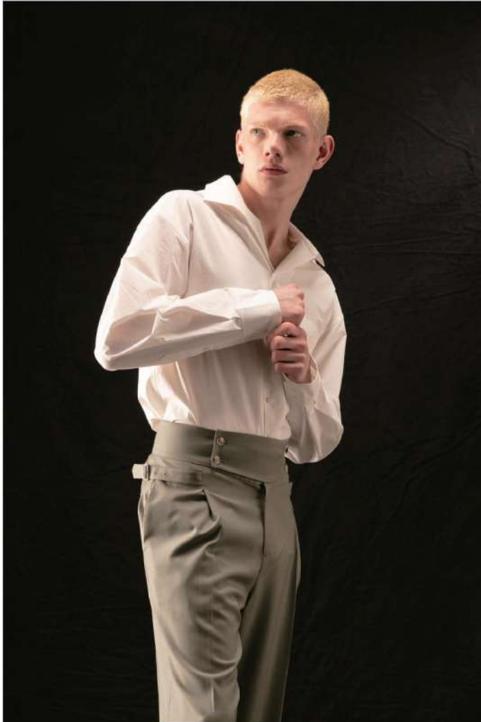
Collo A Un Pezzo Shirt - ZFW26SH0641 Main: 35% Pima Cotton, 65% Aussie Cotton Size Range: XS-XL