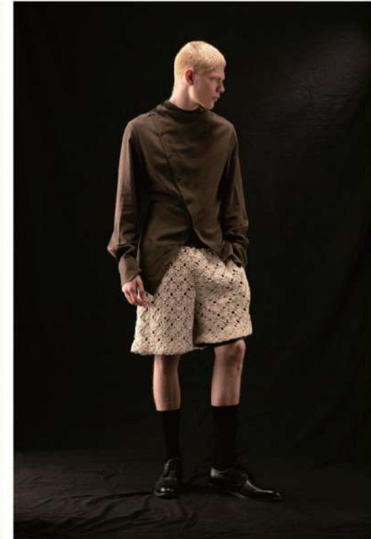
Floral Soutache Shorts - ZFW26TR0971 Main: 65% Polyester, 35% Cotton Size Range: XS-XL