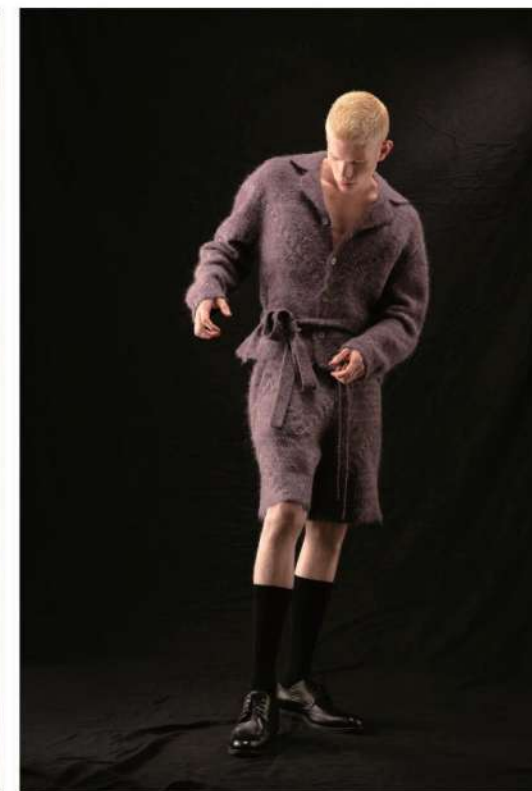
Brushed Argyle Knit Shorts - ZFW26KN1303 Main: 59% Alpaca, 25% Acrylic, 15% Nylon, 1% Spandex Size Range: XS-XL