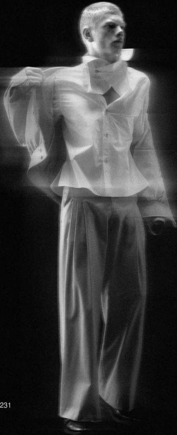
Foulard Shirt - ZFW26SH0231 Main: 100% Cotton Size Range: XS-XL