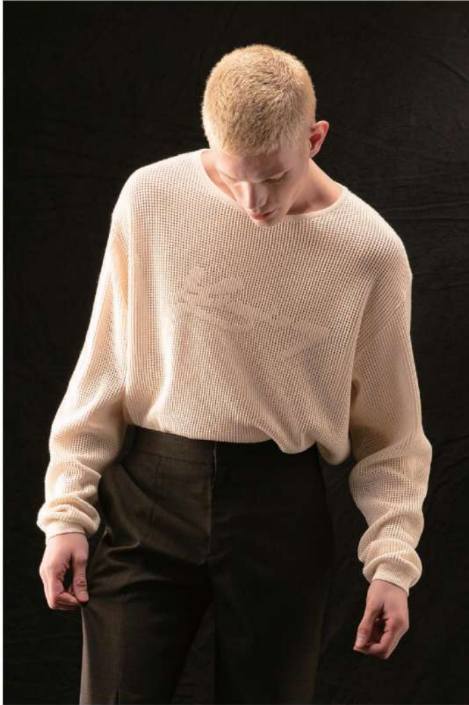
Cursive Boat Neck Jumper - ZFW26KN0401 Main: 55% Alpaca, 15% Wool, 24% Nylon, 6% Spandex Size Range: XS-XL