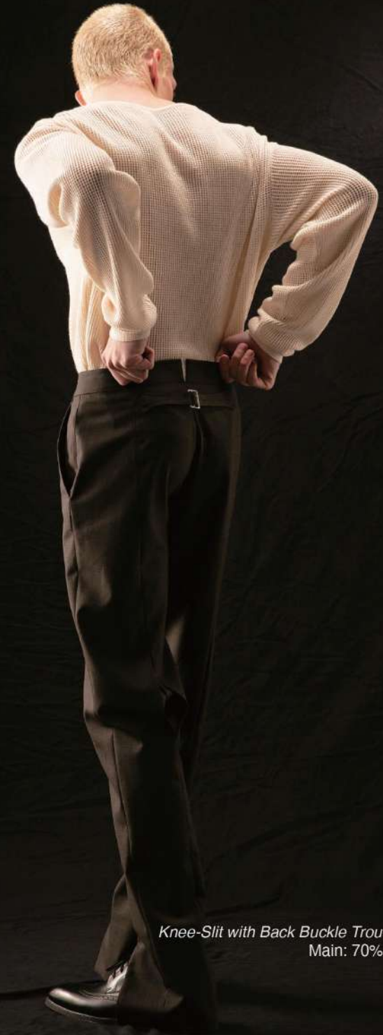
Knee-Slit with Back Buckle Trousers - ZFW26TR0206 Main: 70% Wool, 30% Polyester Size Range: XS-XL