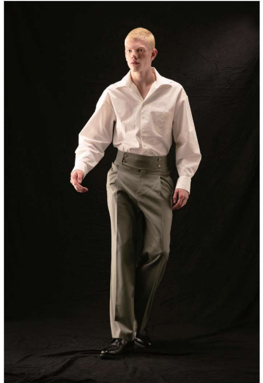
V-Waist Side Buckle Trousers - ZFW26TR0461 Main: 100% Wool Size Range: XS-XL