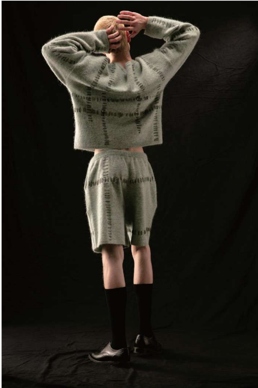
Windowpane Brushed Knit Shorts - ZFW26KN1101 Main: 55% Alpaca, 15% Wool, 24% Nylon, 6% Spandex Size Range: XS-XL