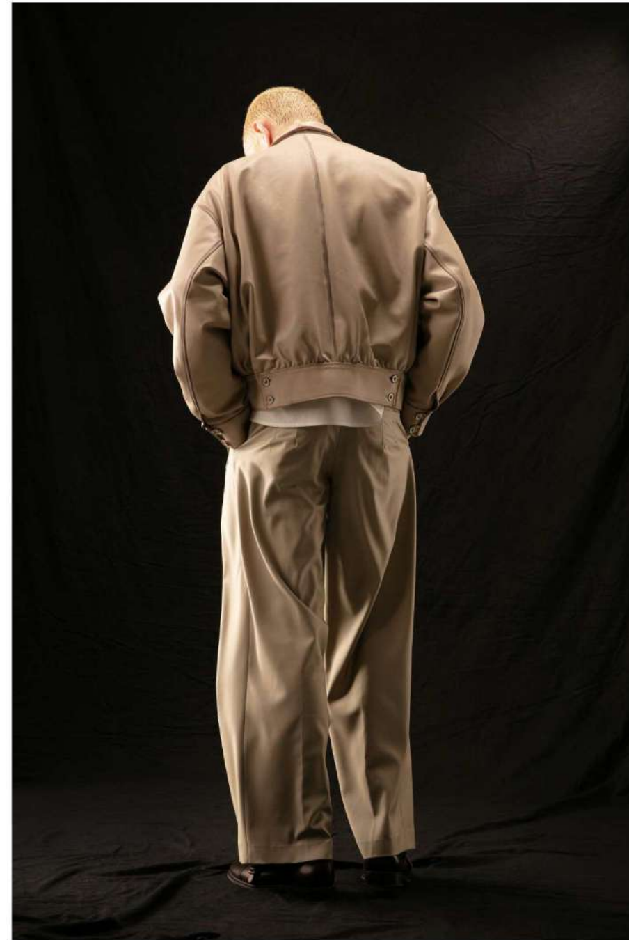
Shawl Lapel Distressed Leather Jacket - ZFW26JKT0512 Shell: 100% Lambskin / Secondary: 100% Cupro Size Range: XS-XL