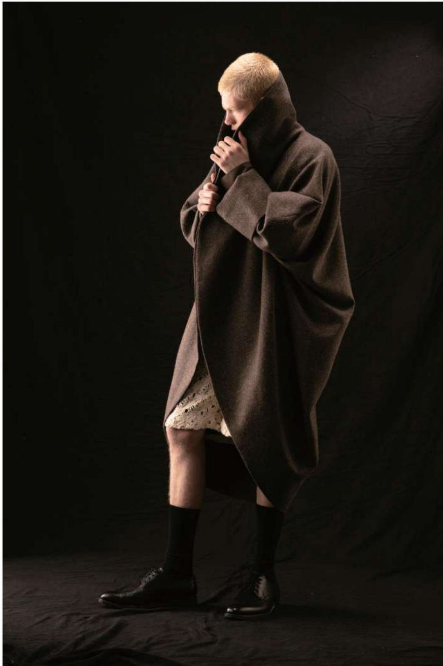
Oversized One-Piece Cocoon Coat - ZFW26CT0205 Shell = 95% Wool, 5% Silk / Lining: 100% Tencel Size Range: XS-XL