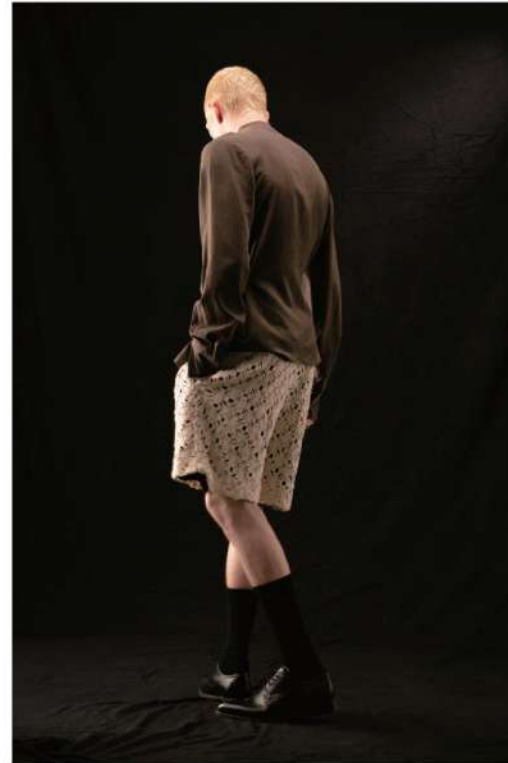
Diagonal Shirt - ZFW26SH0121 Main: 100% Lyocell Size Range: XS-XL