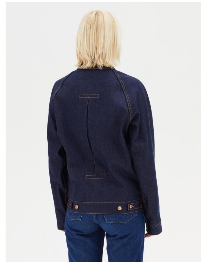
Indigo Selvedge Denim Jacket