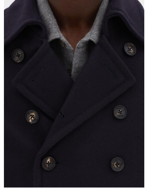
Navy Blue Pea Coat in 100% 600g wool Melton with a 100% cotton body lining. Also available in black.