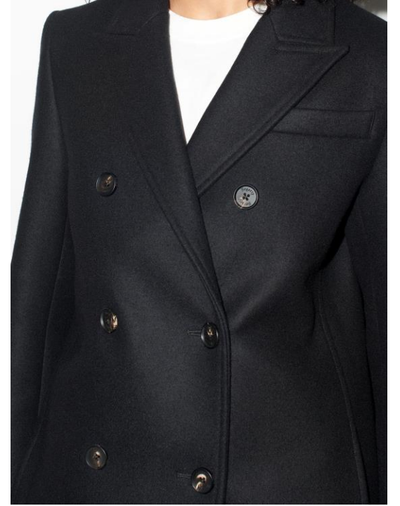
Double Breasted Cashmere and Wool Overcoat. Made from 20% Cashmere and 80% wool with a duchess satin body lining.