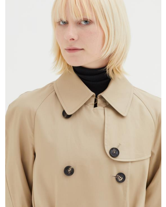
Trench Coat made from 100% Garbardine Cotton with a khaki 100%cotton body lining.