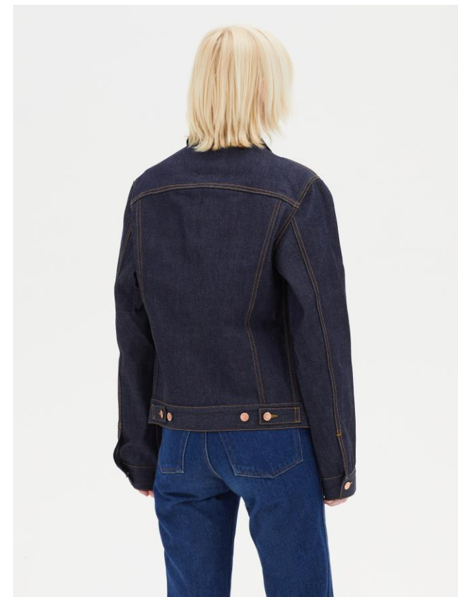
Raw Indigo Denim Trucker Jacket