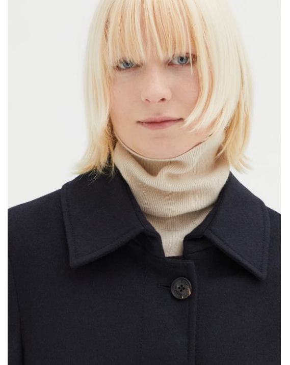
Single Breasted Cashmere and Wool Over Coat. 5% cashmere and 95% wool with a 100% cotton body lining.