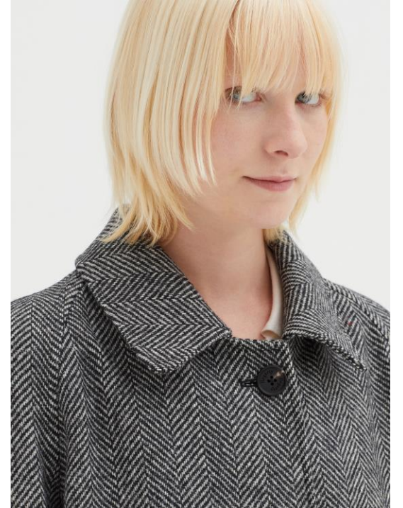
Tweed Overcoat made from English Tweed and a duchess satin body lining.