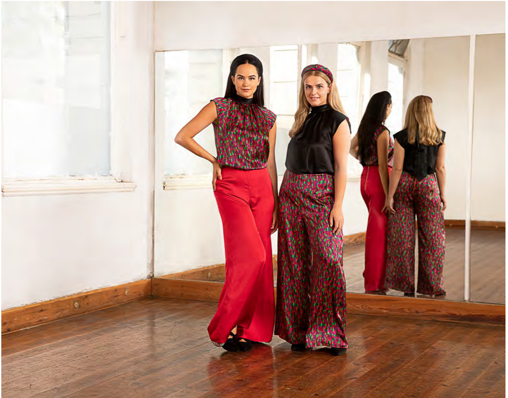
REVERSIBLE Maya Silk Satin Top in Floating Vision/Black & REVERSIBLE Fern Palazzo Pants in Floating Vision/Raspberry Pink Styled with the Floating Vision Silk Satin Headband