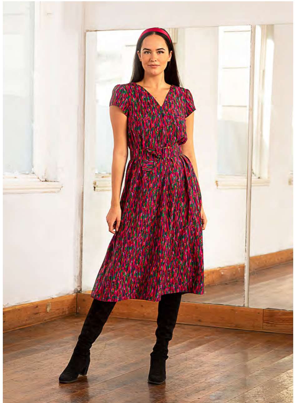
Valentina Silk Bamboo Dress in Floating Vision Styled with the Raspberry Pink Headband