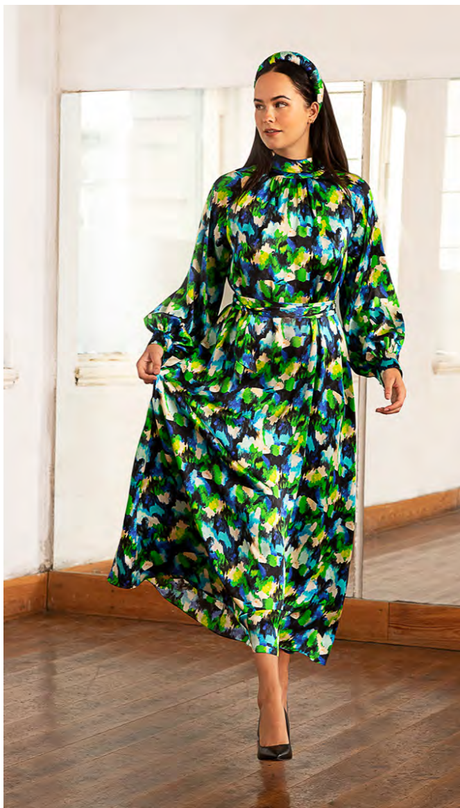
Lexie Silk Satin Long Dress in Miami Splash Styled with the Miami Splash Silk Satin Padded Headband