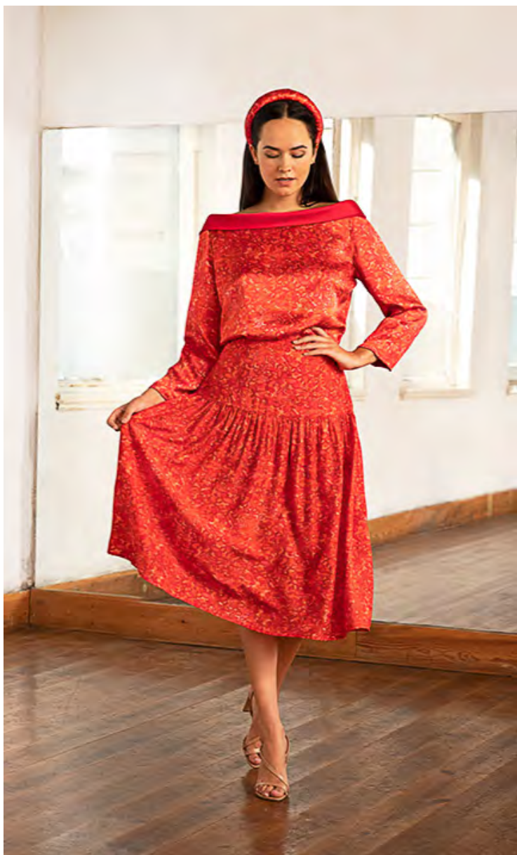
REVERSIBLE Hayley Silk Satin Top in Miami Passion/Raspberry Pink & Lola Silk Bamboo Skirt in Miami Passion Styled with the Miami Passion Silk Satin Padded Headband