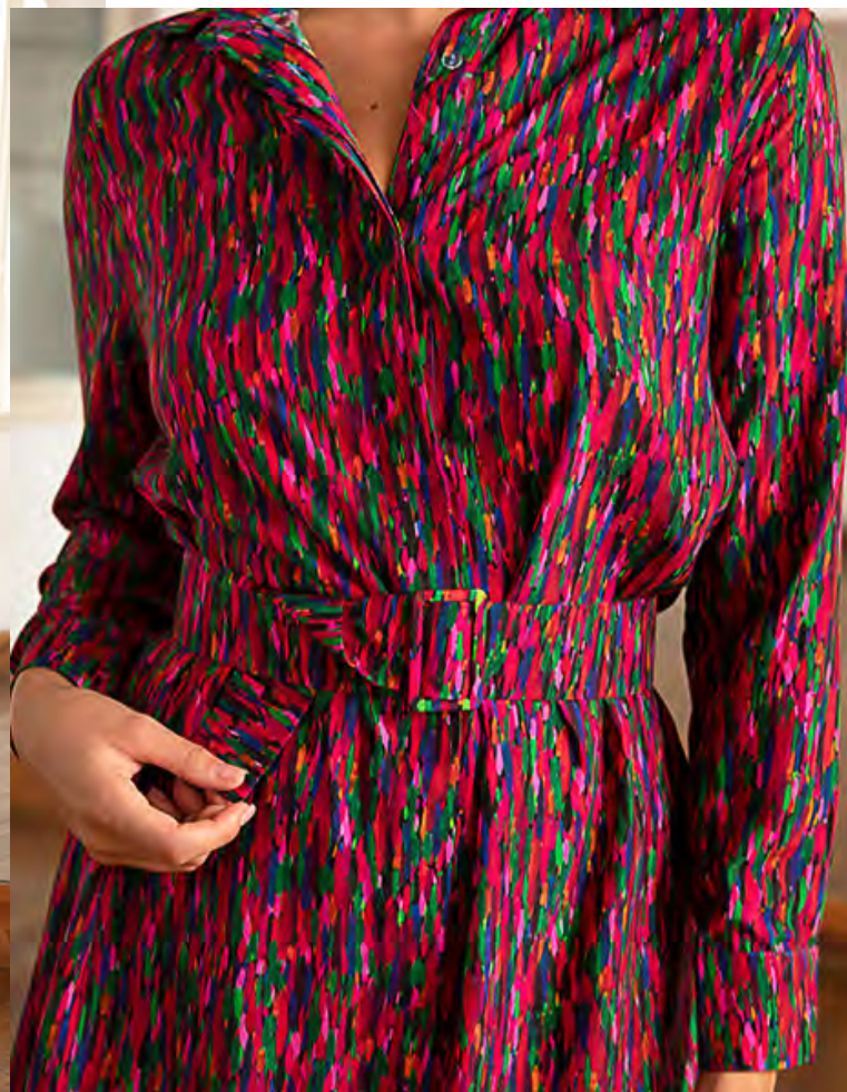
Esme Silk Bamboo Shirt Dress in Floating Vision Styled with the Green Headband