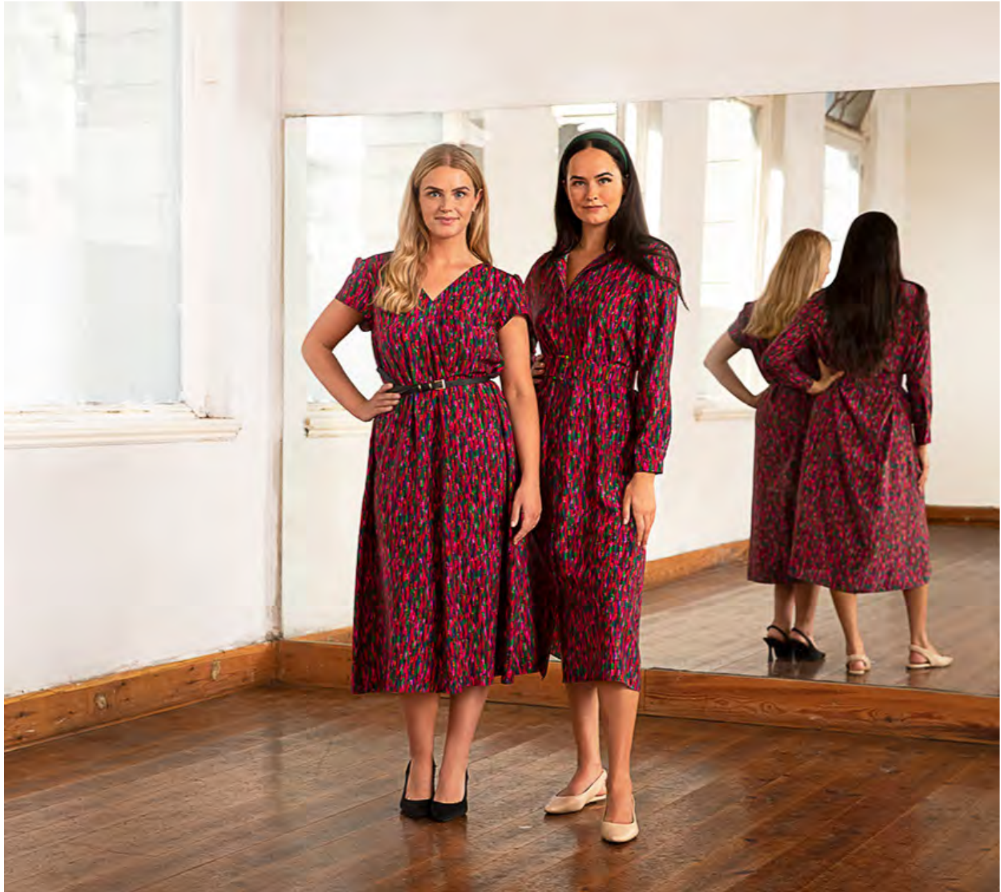
Valentina Silk Bamboo Dress in Floating Vision & Esme Silk Bamboo Shirt Dress in Floating Vision