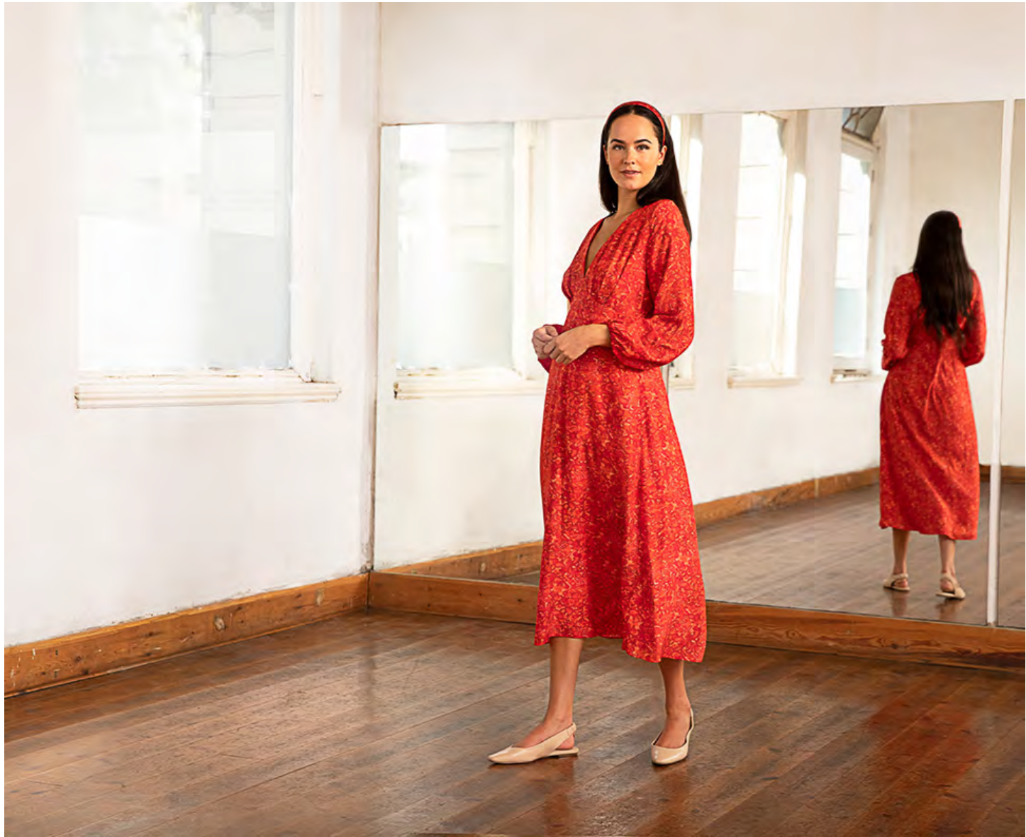
Amelia Silk Bamboo Dress in Miami Passion Styled with the Miami Passion Headband