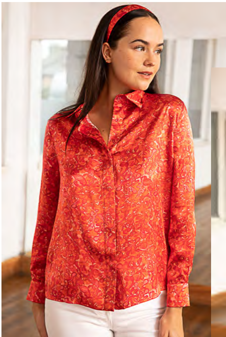
Lisa Silk Satin Shirt in Neon Light Styled with the Neon Light Silk Satin Headband