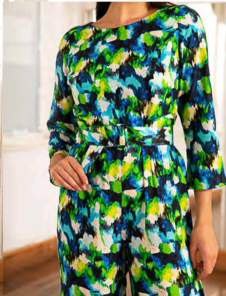
Annabel Silk Bamboo Jumpsuit in Miami Splash