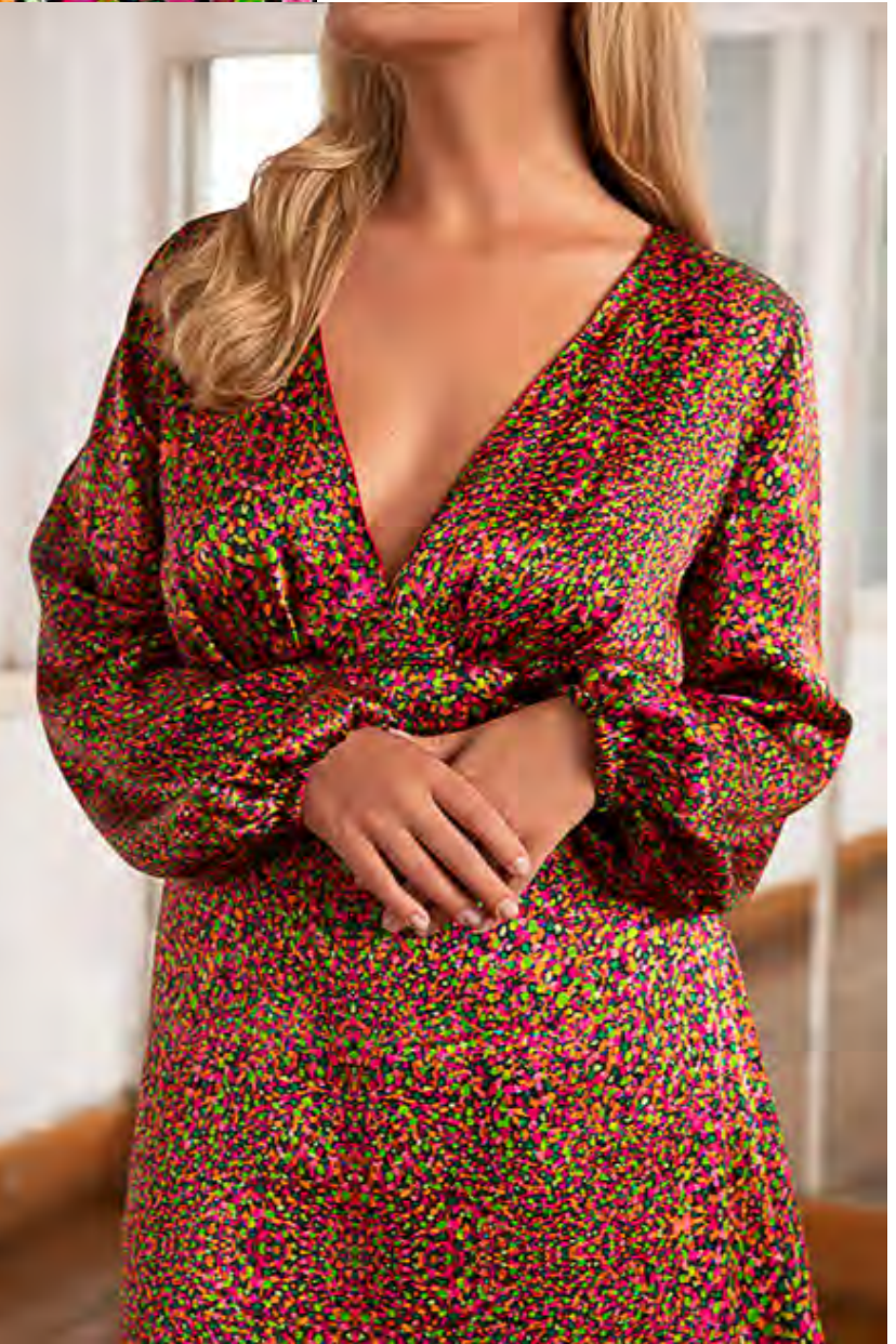
REVERSIBLE Amelia Silk Satin Dress in Neon Light/Raspberry Pink