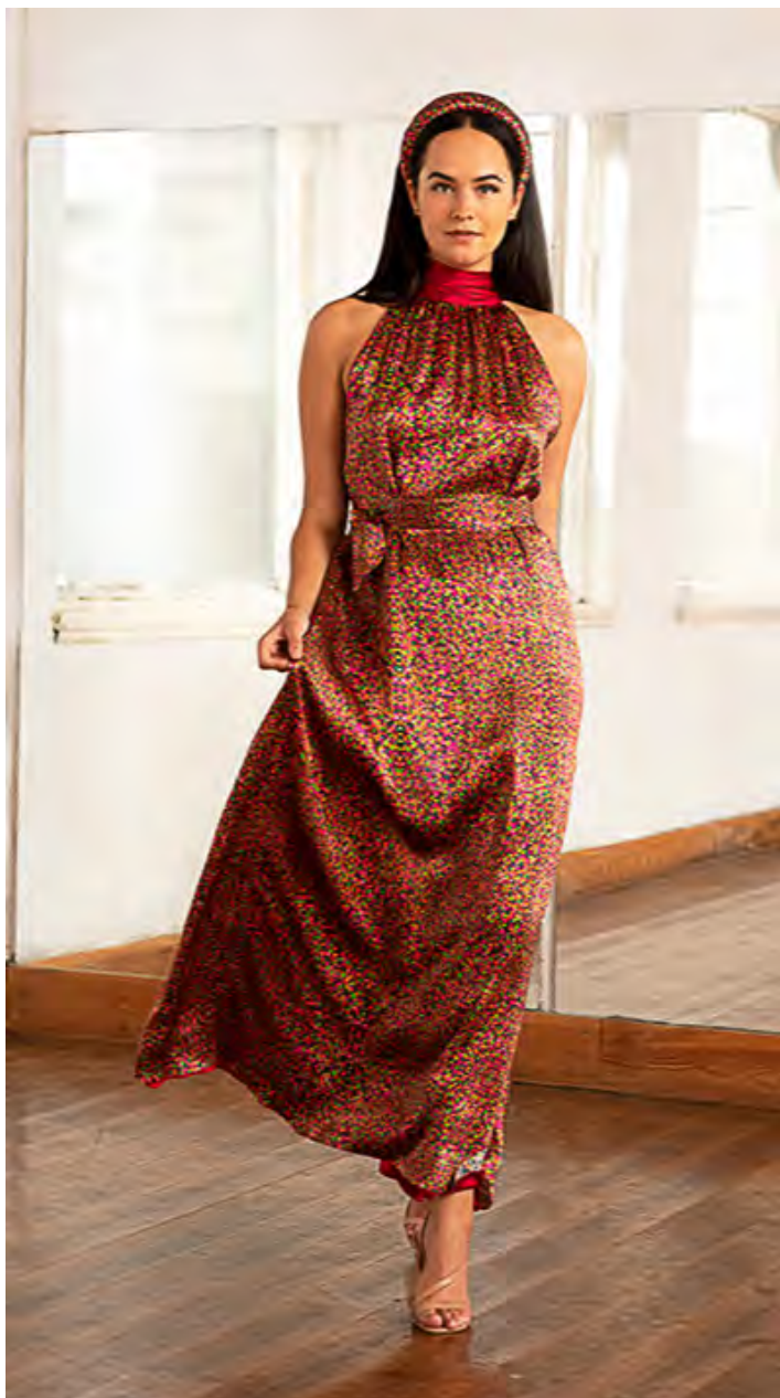
REVERSIBLE Patricia Silk Satin Dress in Neon Light/Raspberry Pink Styled with the Neon Light Silk Satin Padded Headband