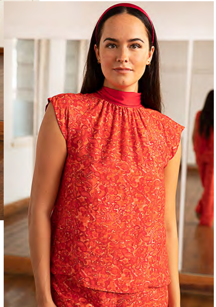
REVERSIBLE Maya Top in Miami Passion & Amy Silk Bamboo Trousers in Miami Passion Styled with the Miami Passion Headband