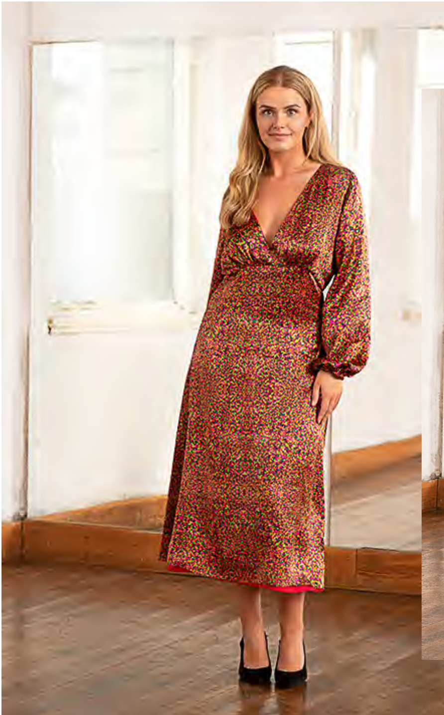
REVERSIBLE Amelia Silk Satin Dress in Neon Light/Raspberry Pink Styled with the Neon Light Silk Satin Padded Headband