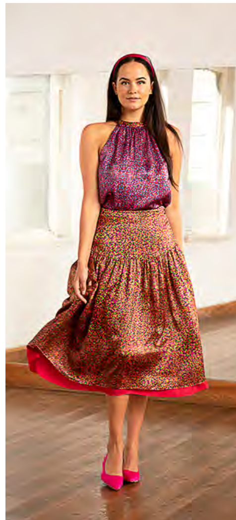
REVERSIBLE Annie Top in Violet Dream/Neon Light & REVERSIBLE Lola Skirt in Neon Light/Raspberry Pink Styled with the Neon Light Silk Satin Padded Headband