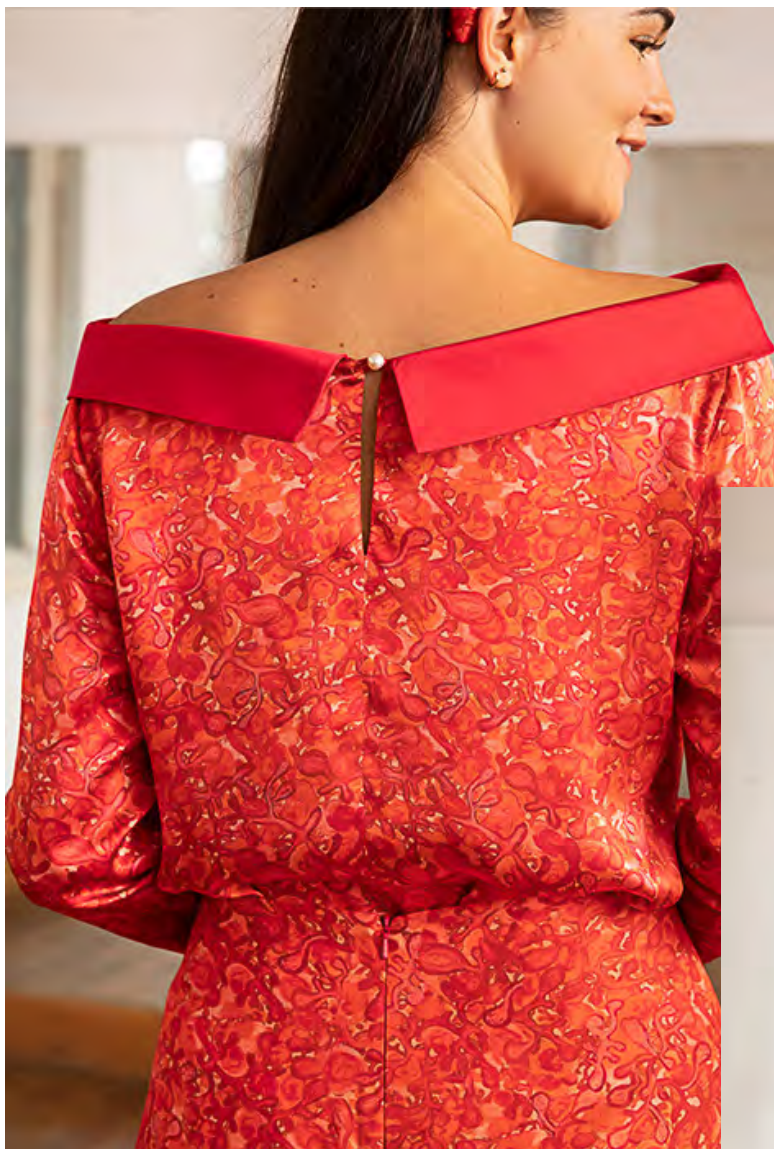
REVERSIBLE Hayley Silk Satin Top in Miami Passion/ Raspberry Pink