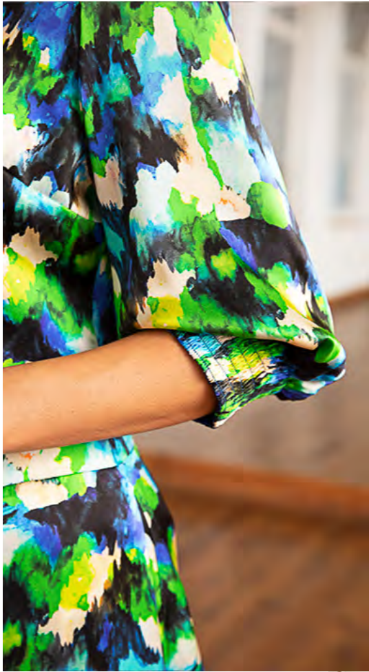
REVERSIBLE Gemma Silk Satin Top in Miami Splash/Cobalt & REVERSIBLE Lizzy Silk Satin Skirt in Miami Splash/Cobalt