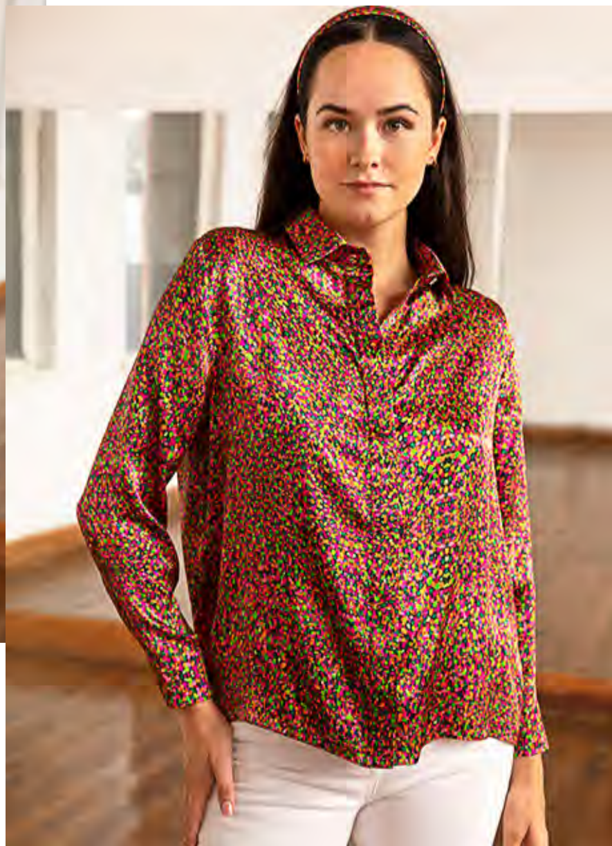
Lisa Silk Satin Shirt in Miami Passion Styled with the Miami Passion Silk Satin Headband