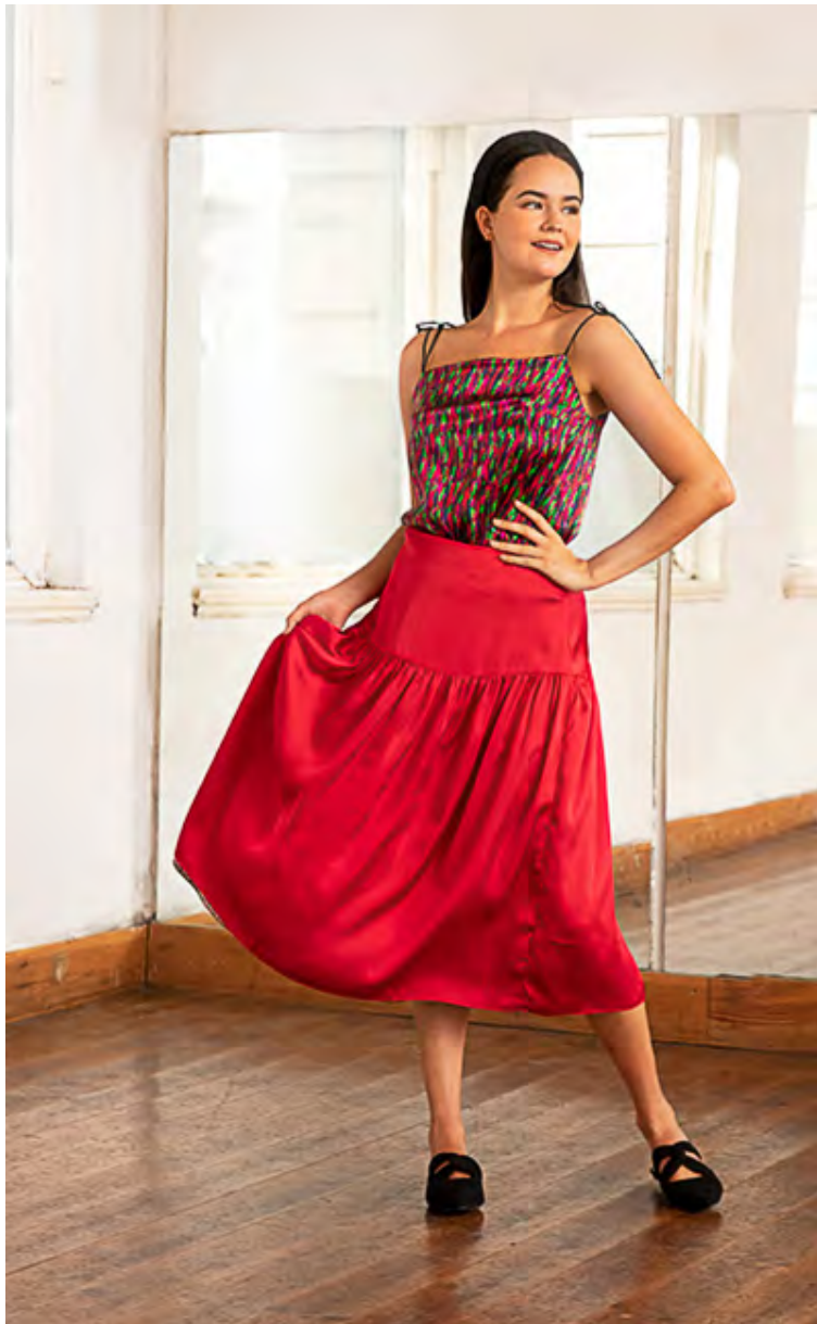
REVERSIBLE Freya Top in Floating Vision/Miami Splash & REVERSIBLE Lola Skirt in Neon Light/ Raspberry Pink