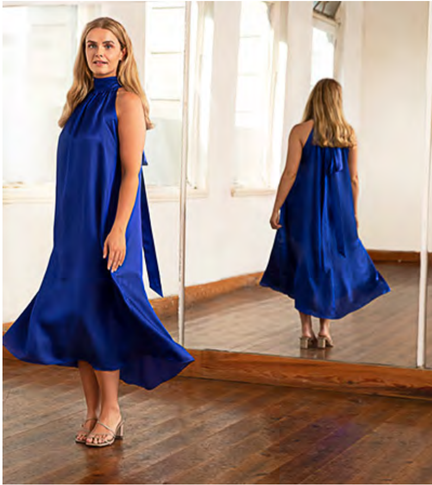
Patricia 3/4 Length Silk Dress in Cobalt