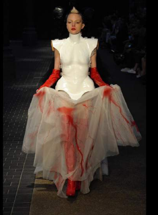
LCF GRADUATE COLLECTION