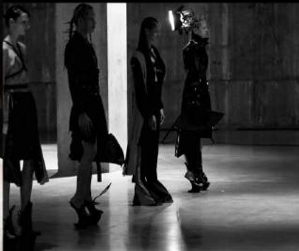
THE TATE MODERN TANKS