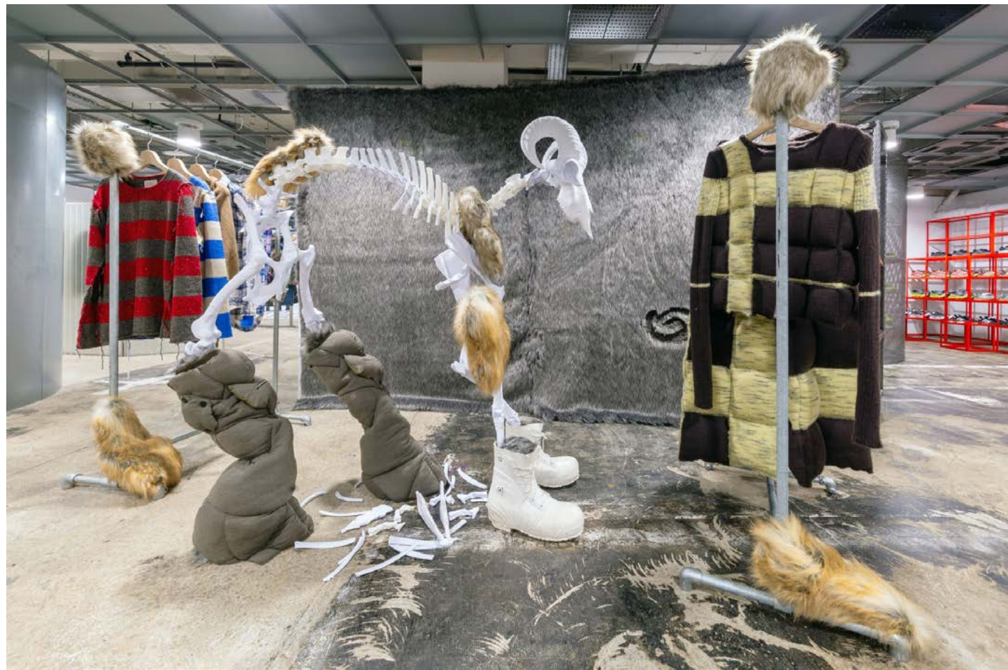
Pop up installation at Dover Street Market London ↑