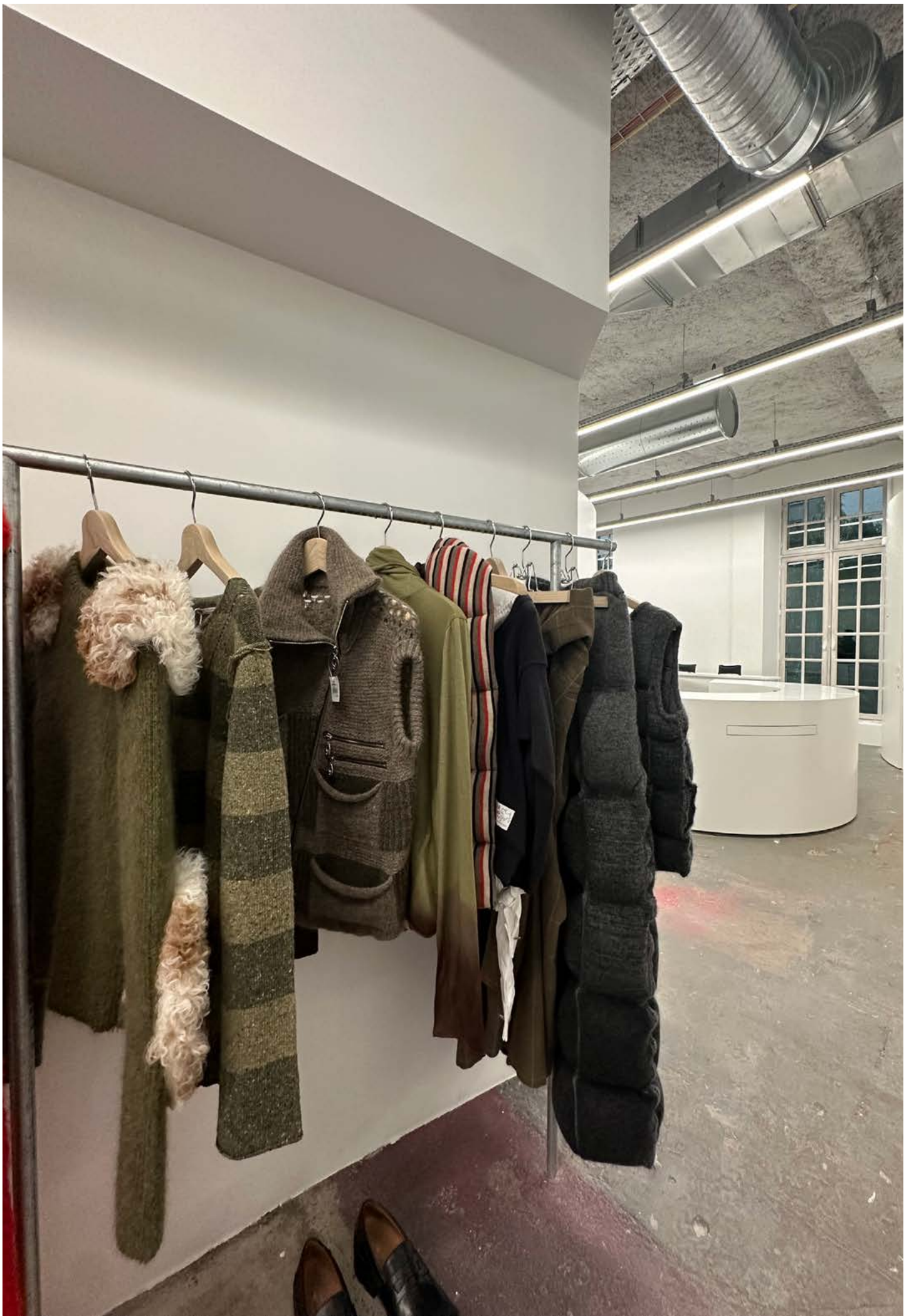
Stock at Dover Street Market Paris →